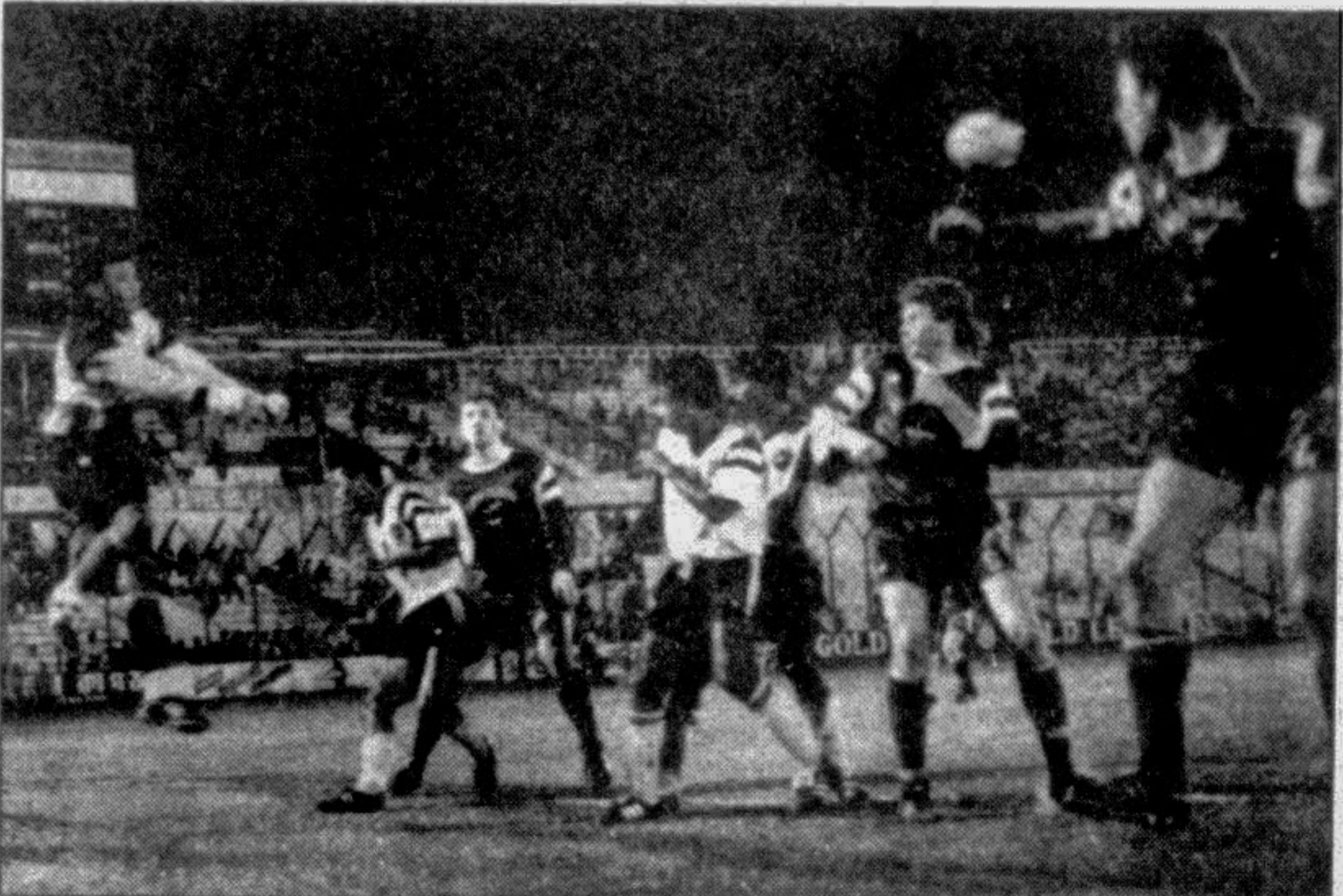
Action in front of the Malaysian goal. The Malaysian Olympic team went down fighting 1-2 against Krylia Sovetov of Russia in the 7th President Gold Cup football tournament yesterday at the Dhaka Stadium.