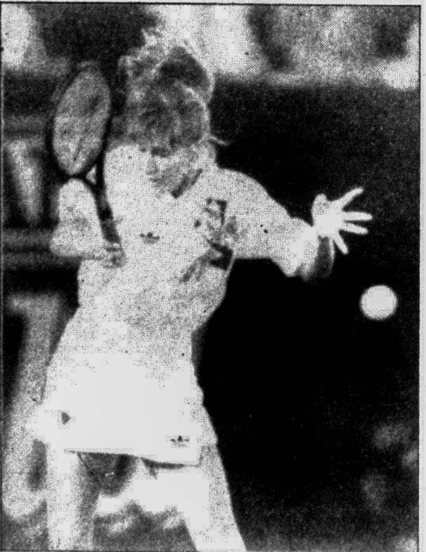
Germany's Steffi Graf in action in the women's singles semifinal match of the Hopman Cup in Perth yesterday. Graf beat Nathalie Tauziat of France in straight sets.