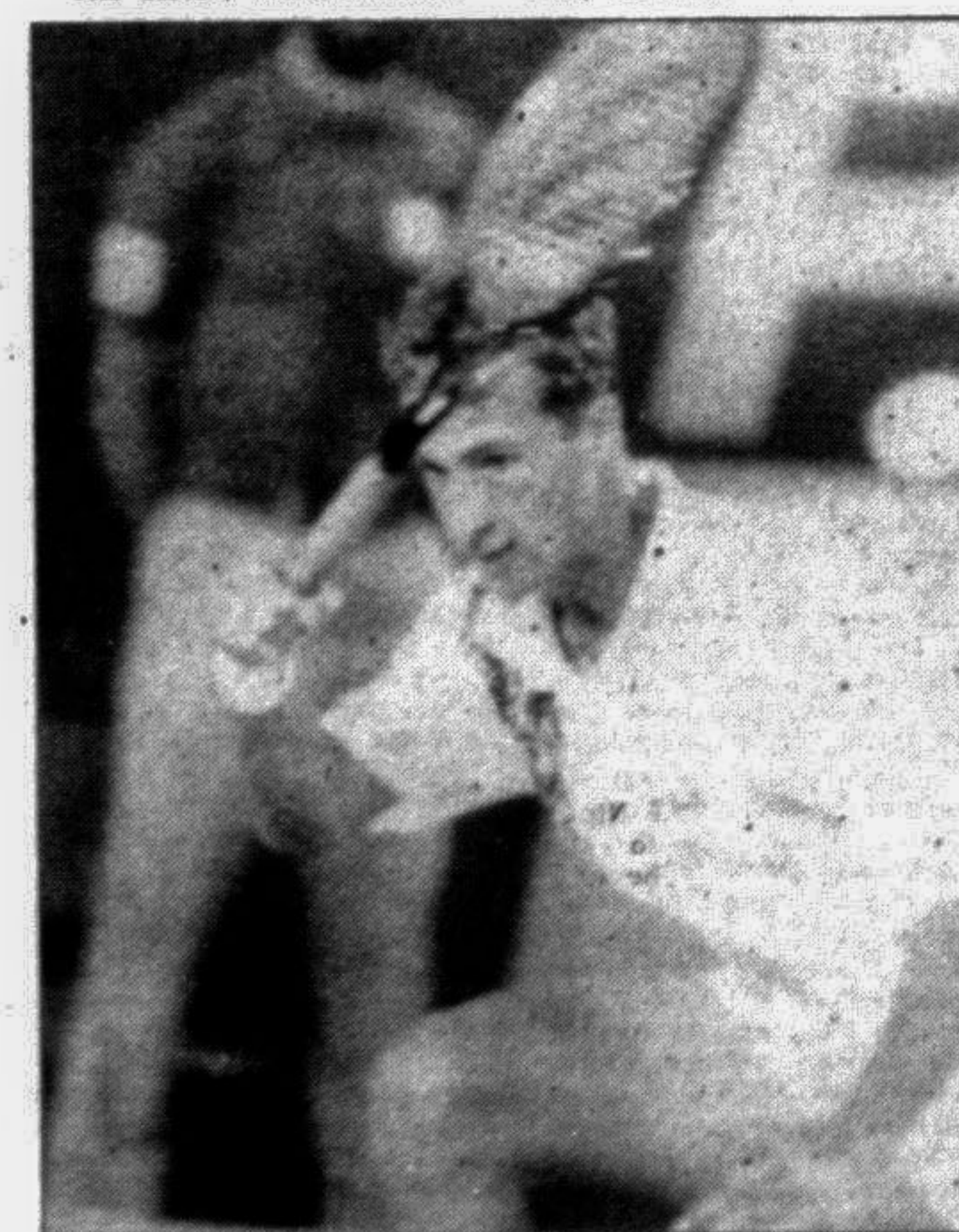
Andrei Medvedev of Ukraine hits the ball to Michael Stich of Germany in the men's singles quarterfinal match of the Hopman Cup in Perth on January 5.

"I'm just looking forward to trying — to seeing what it's like," he said.