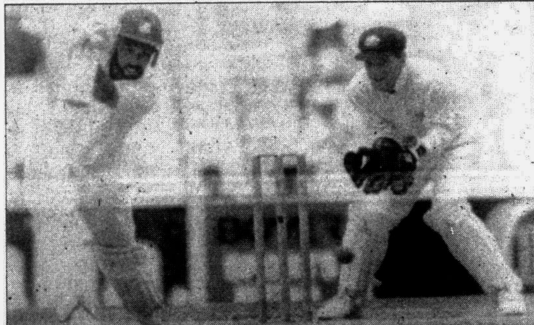
West Indian batsman Jimmy Adams (L) eludes Australian wicket-keeper Ian Healy (R) to be 77 not out at the end of the first innings on the final day of the drawn third Test in Sydney yesterday.

shape. He found no problems with the white balls used in day/night over-day matches.