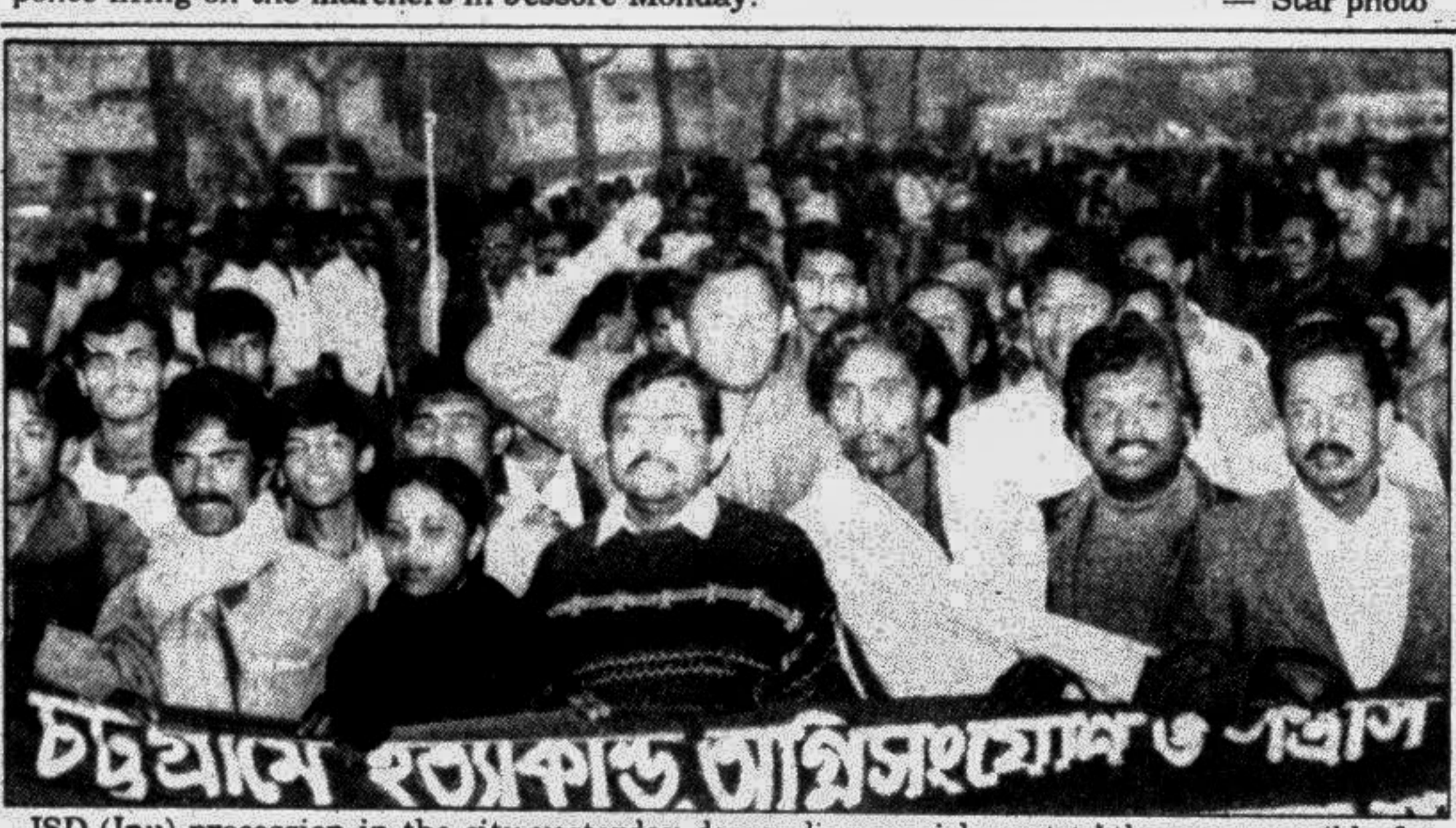
JSD (Inu) procession in the city yesterday demanding punishment to those responsible for Chittagong firing and rampage.