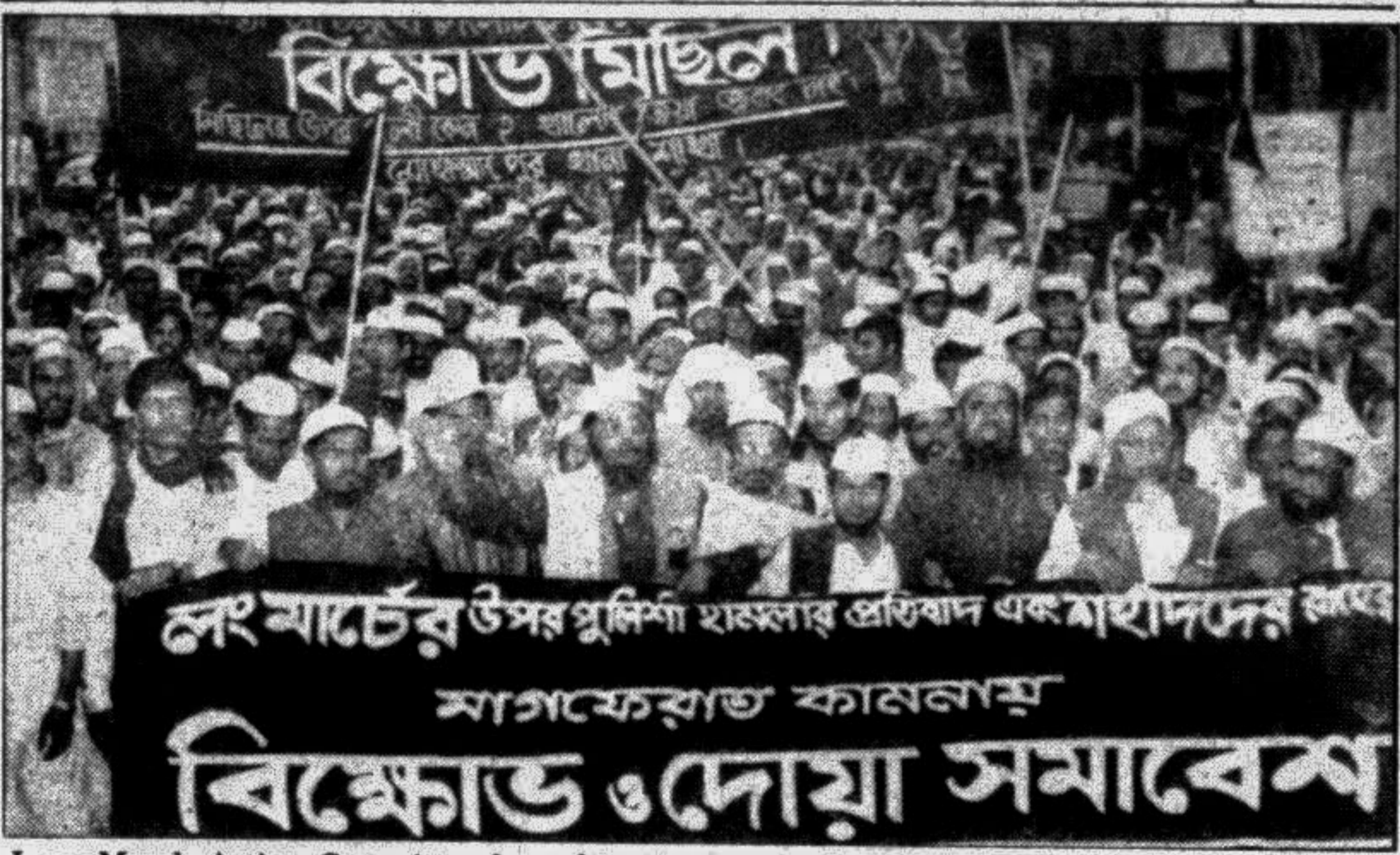
Long March Action Committee brought out a procession yesterday in the city protesting police firing on the marchers in Jessore Monday.