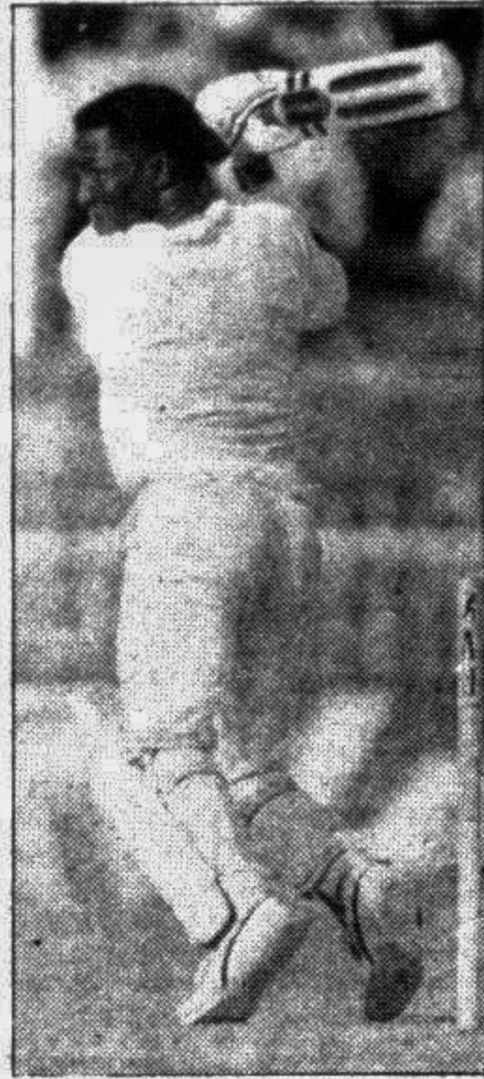
BRIAN LARA... 121 n.o.

still ideal for batting despite the rain showed how painstaking Australia had been in amassing their total almost two days after winning the toss. Lara later discounted suggestions that the West Indies best hope was a draw. "One this wicket I'm looking forward to a double century," he said. "We are still in the game... if we get past their total fast we can put them (Australia) under pressure."