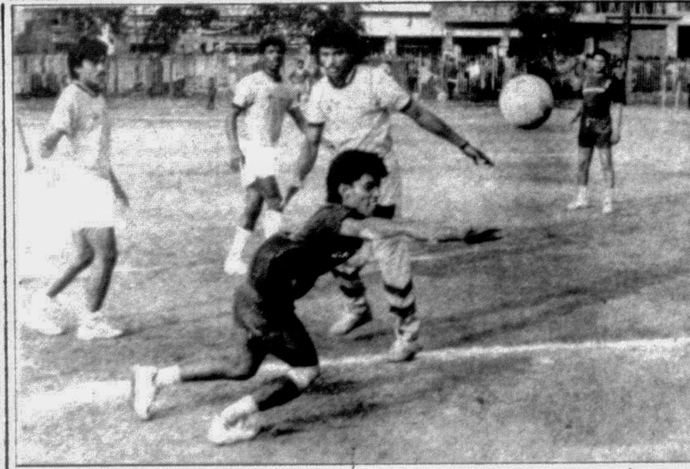
Action from yesterday's Sunball Second Division handball league encounter between Nawabpur SC and Sachetan Goshthi at the Outer Stadium yesterday.