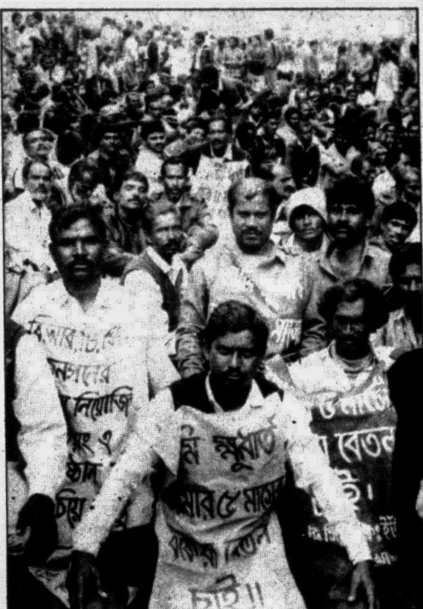
A BRTC workers' procession in city yesterday.

5.00 Opening announcement Al-Quran Programme summary 5.10 News in Bangla 5.25 Esho Likhi Pari 6.00 Mayeder Jangna 6.30 Open University 7.05 Nazrul songs 8.00 News in Bangla 8.40 Drama series: Vagyangsha 10.00 News in English 10.30 Film Show: E N G 11.30 Khabar/The News 11.45 Closing