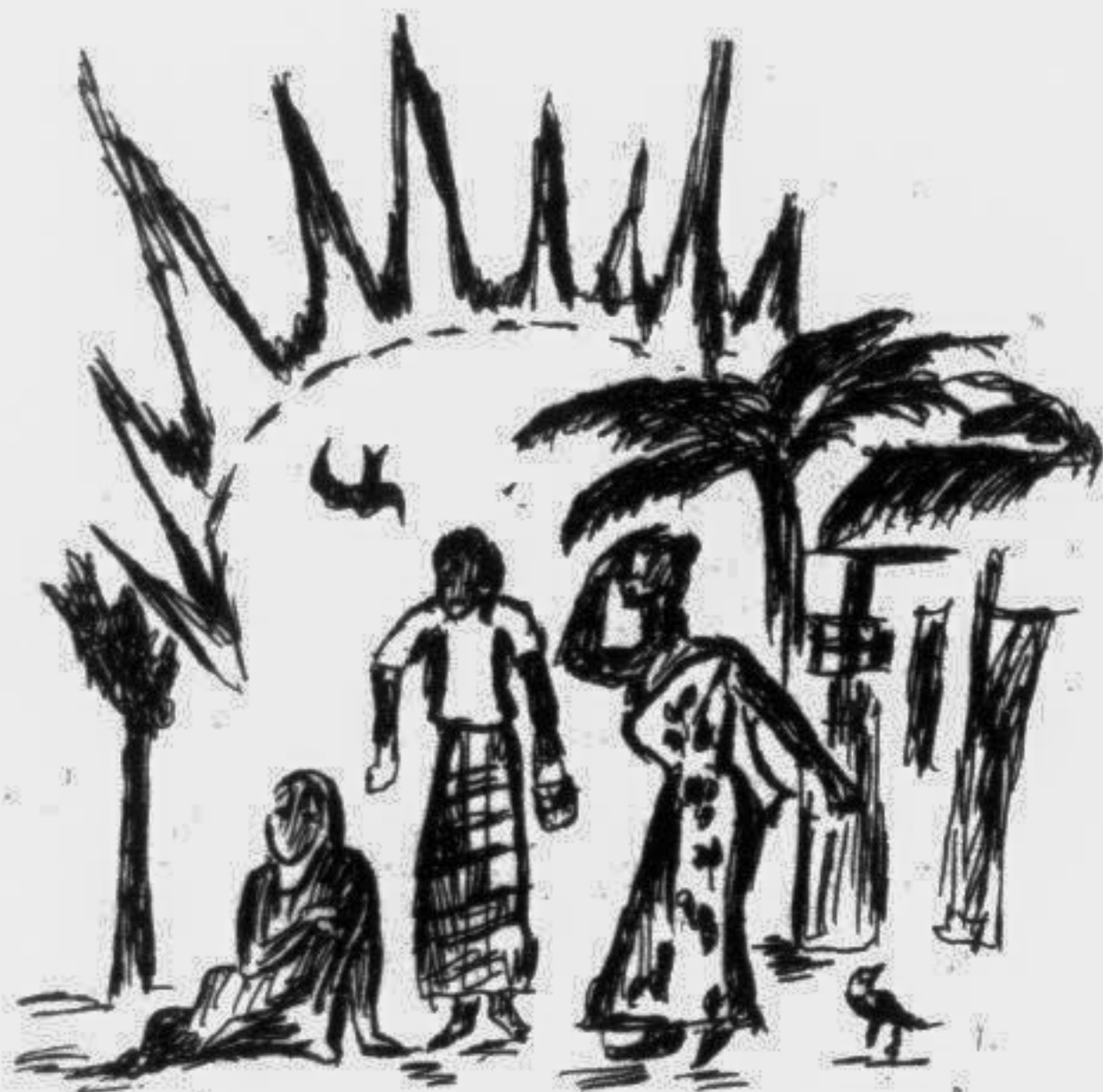
When the heat is killing

There is, however, no denying that those who have the time to lounge in the open in the balmy warmth of winter sunshine present a quiet and comforting picture, exerting a sort of soothing influence on the taut nerves of the city dwellers deprived of such breaks.