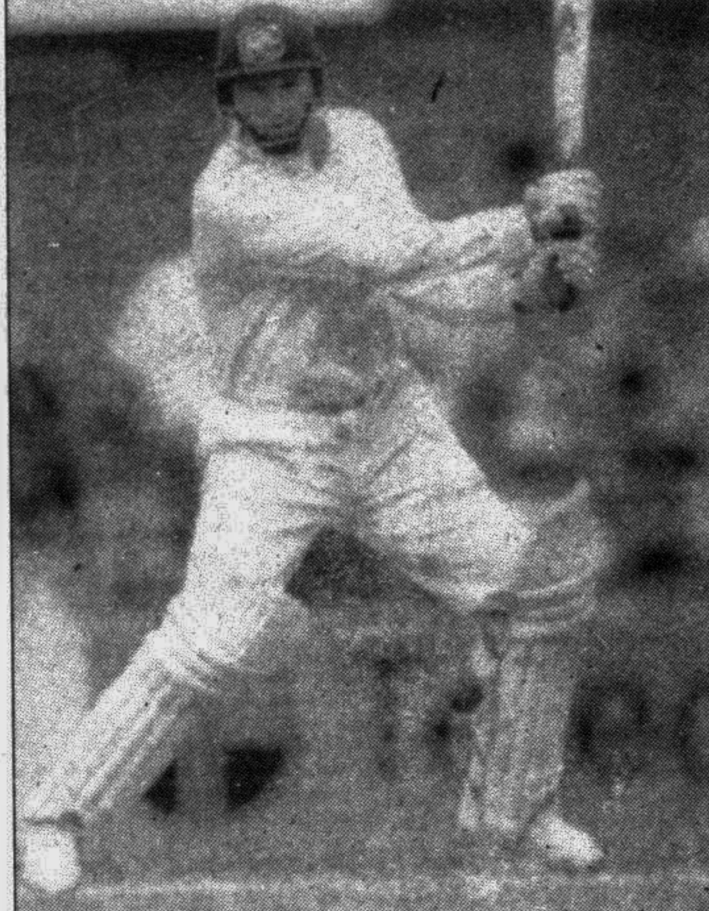
Steve Waugh, the Australian allrounder, is seen in action against the West Indies on the first day of the third test at the Sydney Cricket Ground on January 2. Waugh's ton helped Australia rattle up 272 for five.

Border survived a few testing moments from Ambrose and will resume with Greg Matthews on Sunday.