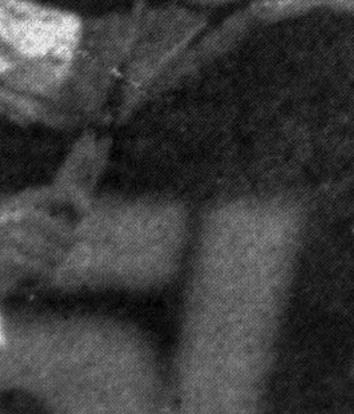
Australia's Wally Masur makes a backhand return against Wayne Ferreira during their men's singles match of the Hopman Cup on January 2. Australia bundled South Africa out of the competition, winning the men's and women's singles as well as the mixed doubles matches.