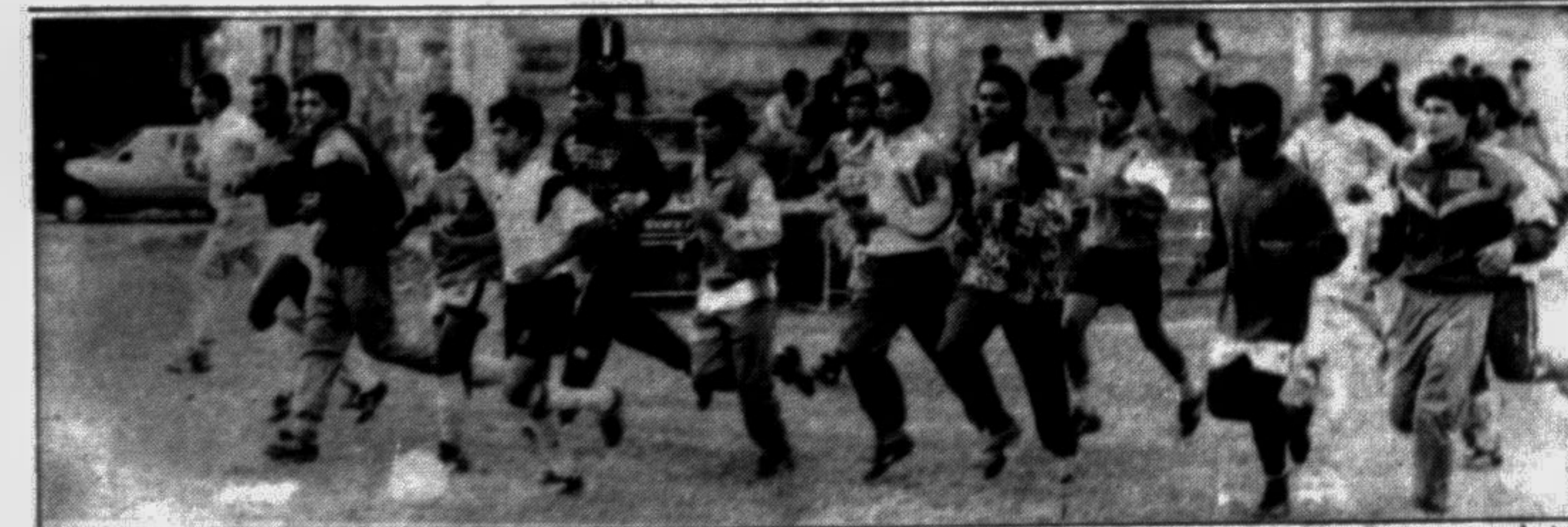
The Bangladesh Reds during practice at the Dhaka University central playground yesterday. The Reds start their President Cup defence on the opening day of the 11-day international soccer meet against FC Polonia Warszawa at the Dhaka Stadium on January 6.