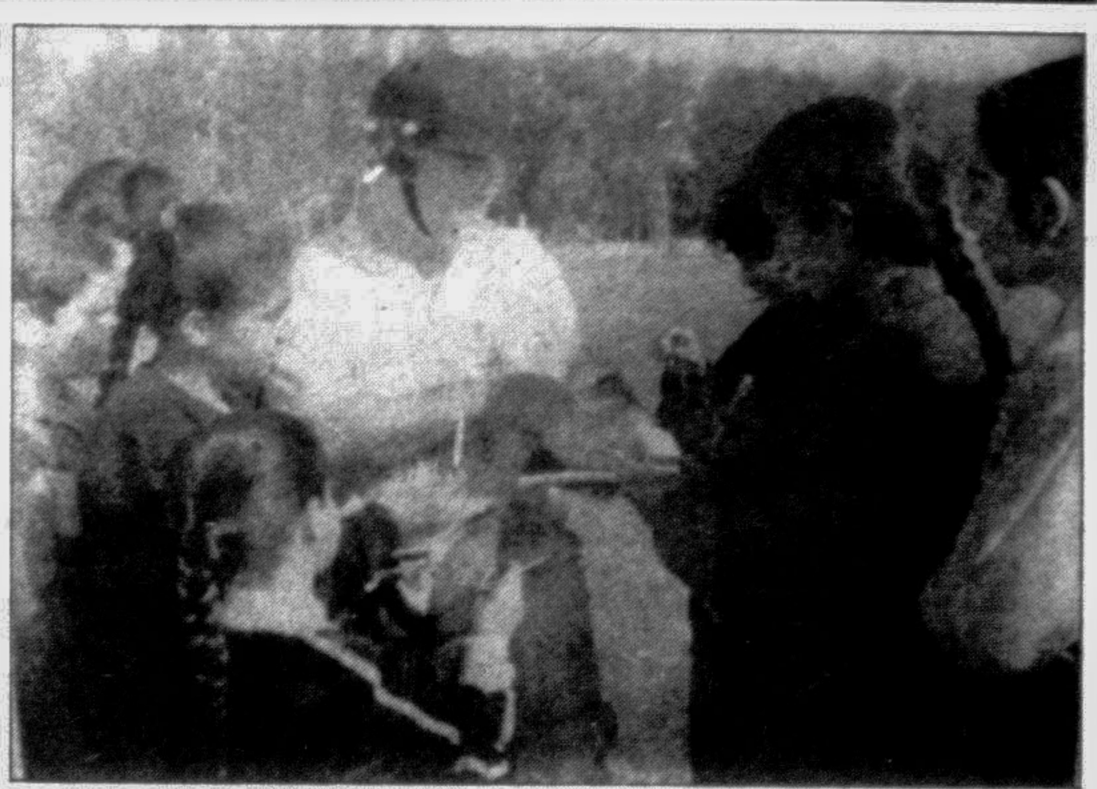
A real happy new year for Mike Gatting who obliges the autograph hunters after a practice session of the touring England team at Feroz Shah Kotla, Delhi on Friday.