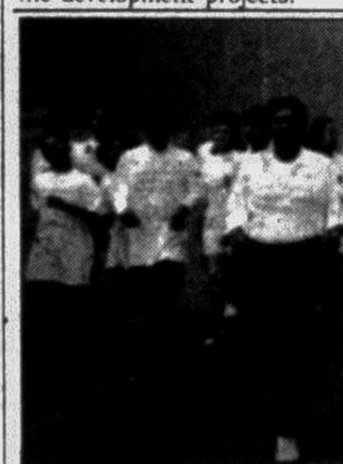
The Nepalese students in the city held a mini-marathon Thursday starting from the International Hotel of Dhaka University to promote SAARC spirit. It went through different areas including the Press Club, Doyel Chattar and Shaheed Minar where they paid homage to the martyrs of the Language Movement.

Taka 33 lakh for construction and reconstruction of 15 UP Bhabans, Tk 8.53 lakh for construction of passenger sheds, and Tk 55.05 lakh for the construction of roads and bridges have been allocated in the development projects.