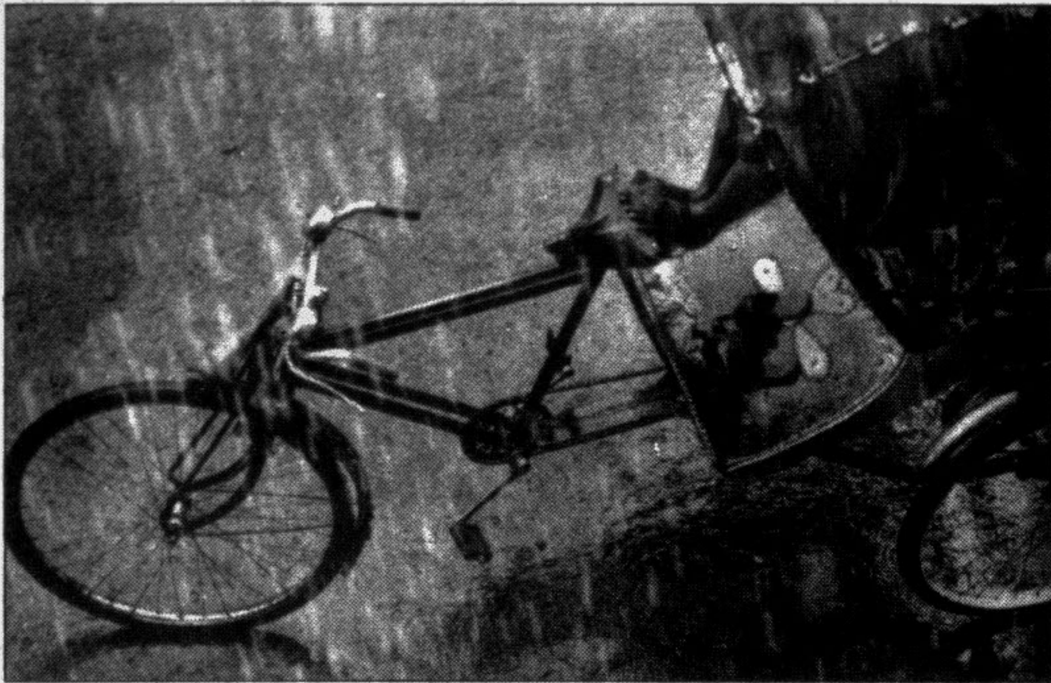
From Drik's 1993 calendar.

What is the first thing you do when the calendars for the new year arrive? There's the initial period of flipping through the pages morosely and shaking your head with disbelief that another year is gone. Once this painful reality is accepted, you begin to take some interest in the matter of the calendar. After all, you certainly don't want to look at grinning Japanese girls draped over shiny new cars for the next 365 days.