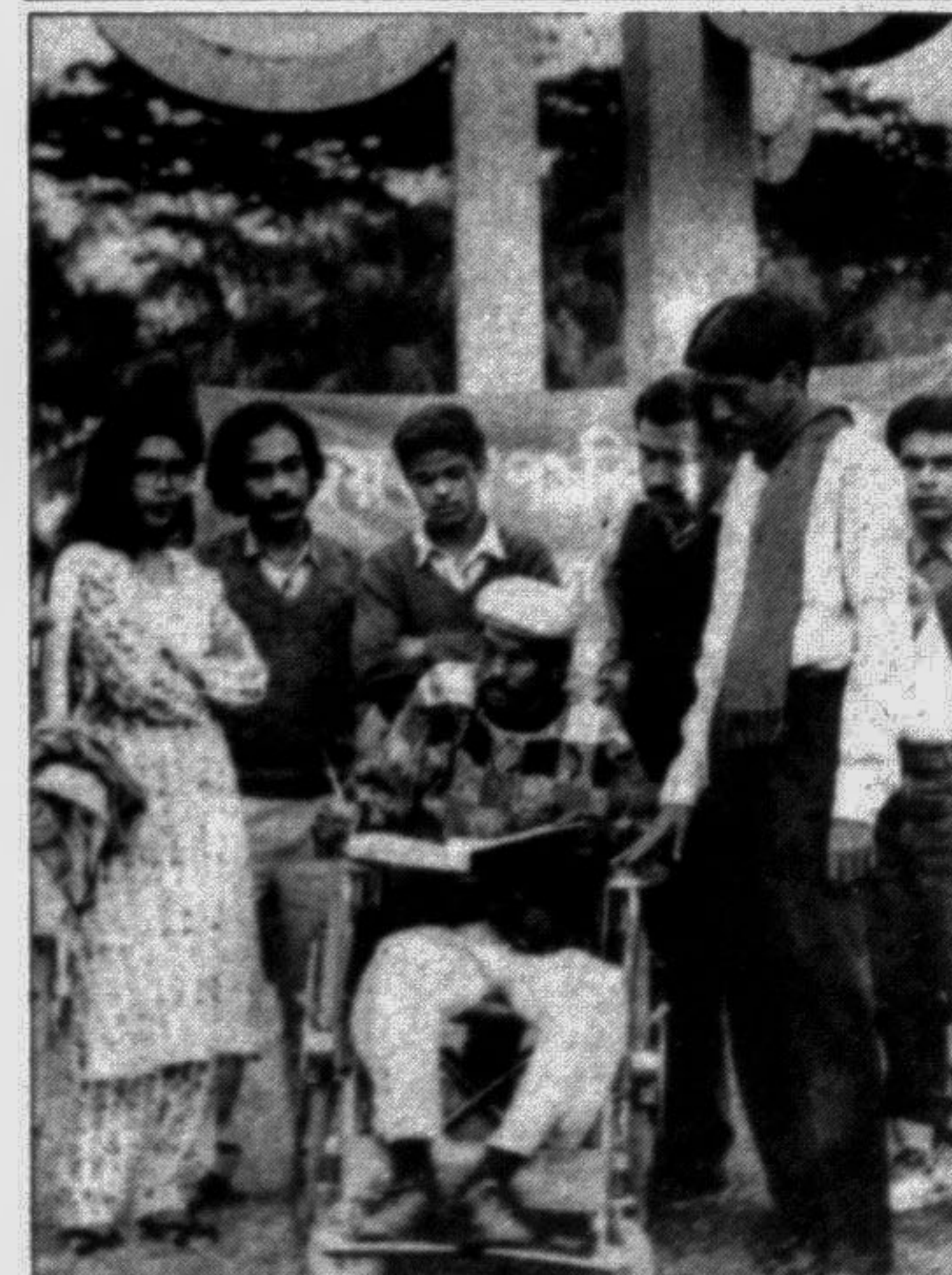
A signature campaign was launched in the city yesterday by the Victory Memorial Implementation Committee demanding erection of a memorial of the martyrs of Liberation War.