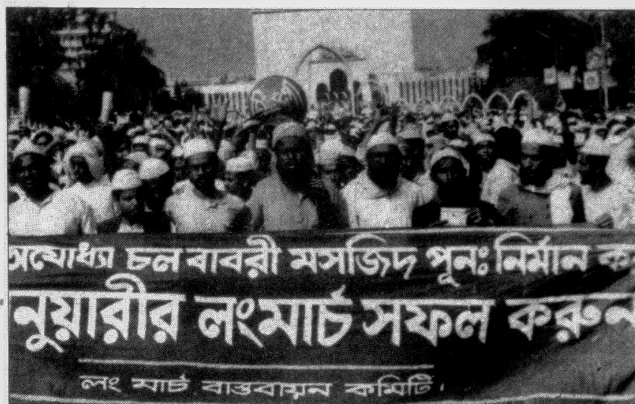
Long March Implementation Committee brought out a procession in the city yesterday to press for rebuilding Babri Mosque and making today's long march a success. (Story on Page 1)