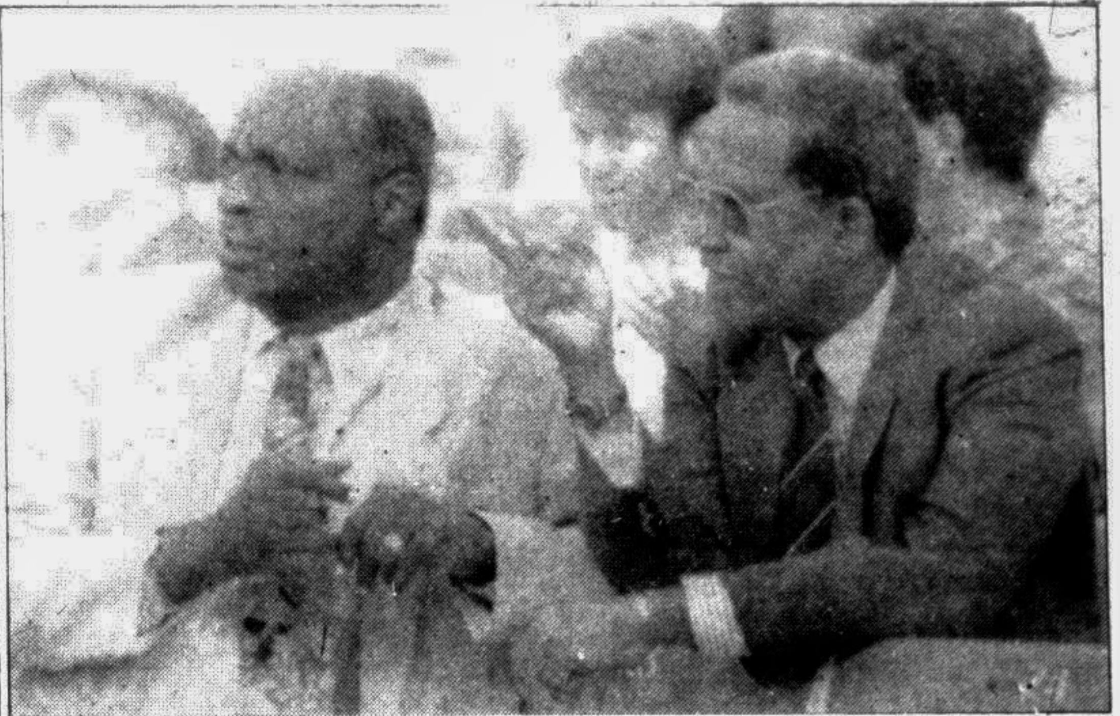
TWO OF CRICKET'S ALL TIME GREATS: Wesley Hall and Sir Garfield Sobers of the West Indies must have been far from satisfied with their team's dismal performance on the final day of the second Test against Australia at the MCG on Wednesday. The Windies lost by 129 runs to go one down in the five-Test series.