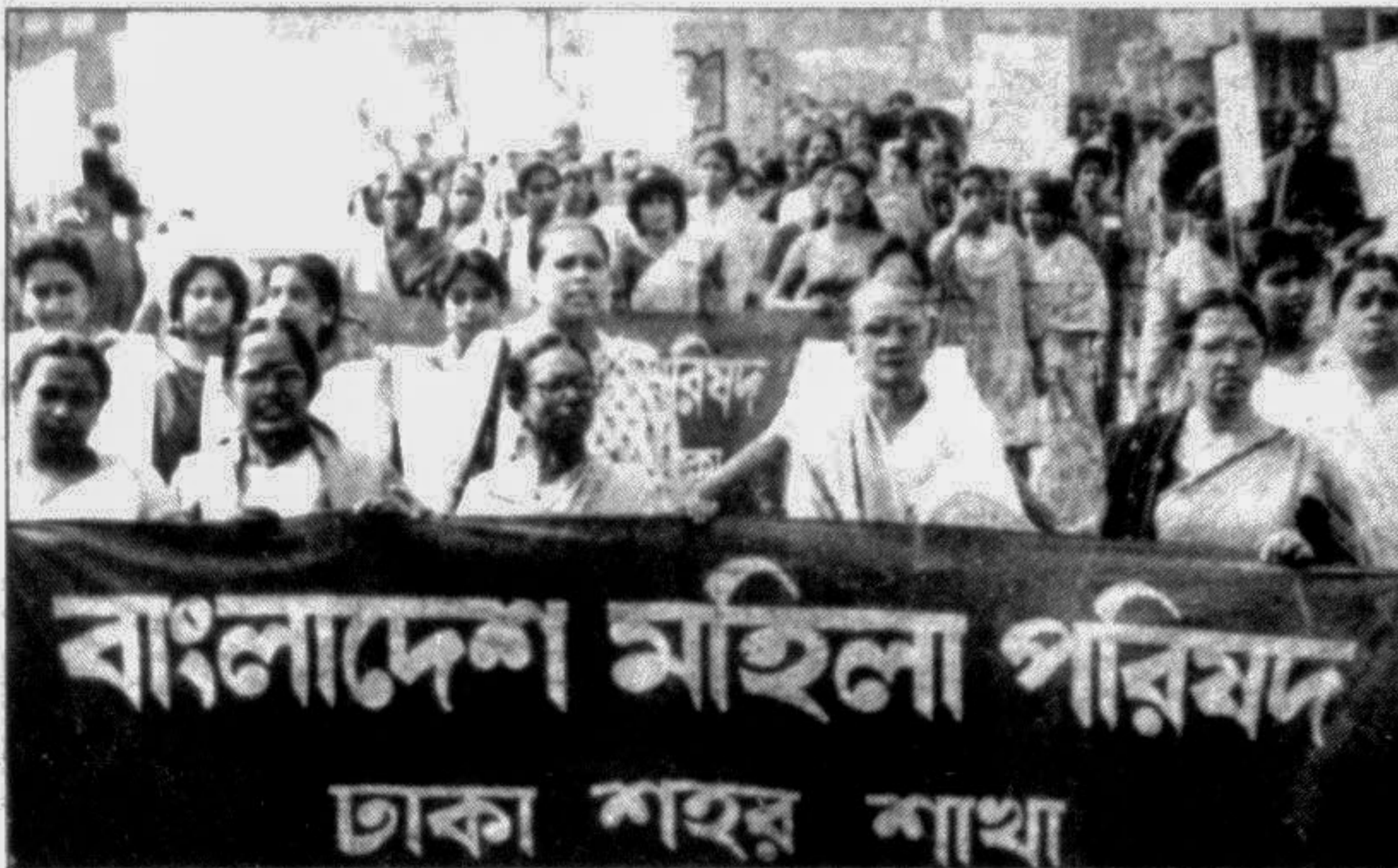
Bangladesh Mahila Parishad brought out a procession in the city after its city unit conference yesterday.