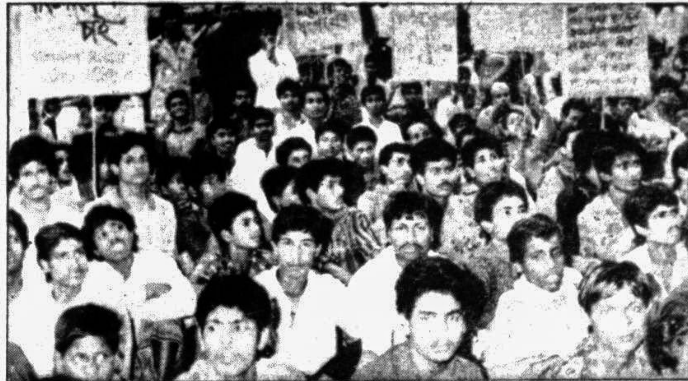
Hotel Restaurant Owners' Association held a rally against terrorism in front of the National Press Club yesterday.