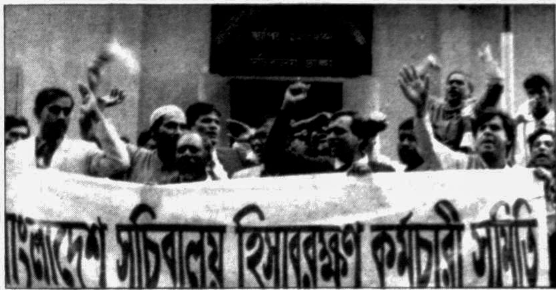
The employees of the Accounts Section of Bangladesh Secretariat staged a demonstration in the city yesterday demanding enhancement of salaries.

The representatives of different ministries and other organisations spoke on the occasion with emphasis on encouraging the establishment of nursery in the private sector, planting of large sized saplings, encouraging Anar and VDP members for preservation of planted trees, increasing responsibility of the union parishad and introducing award giving system.