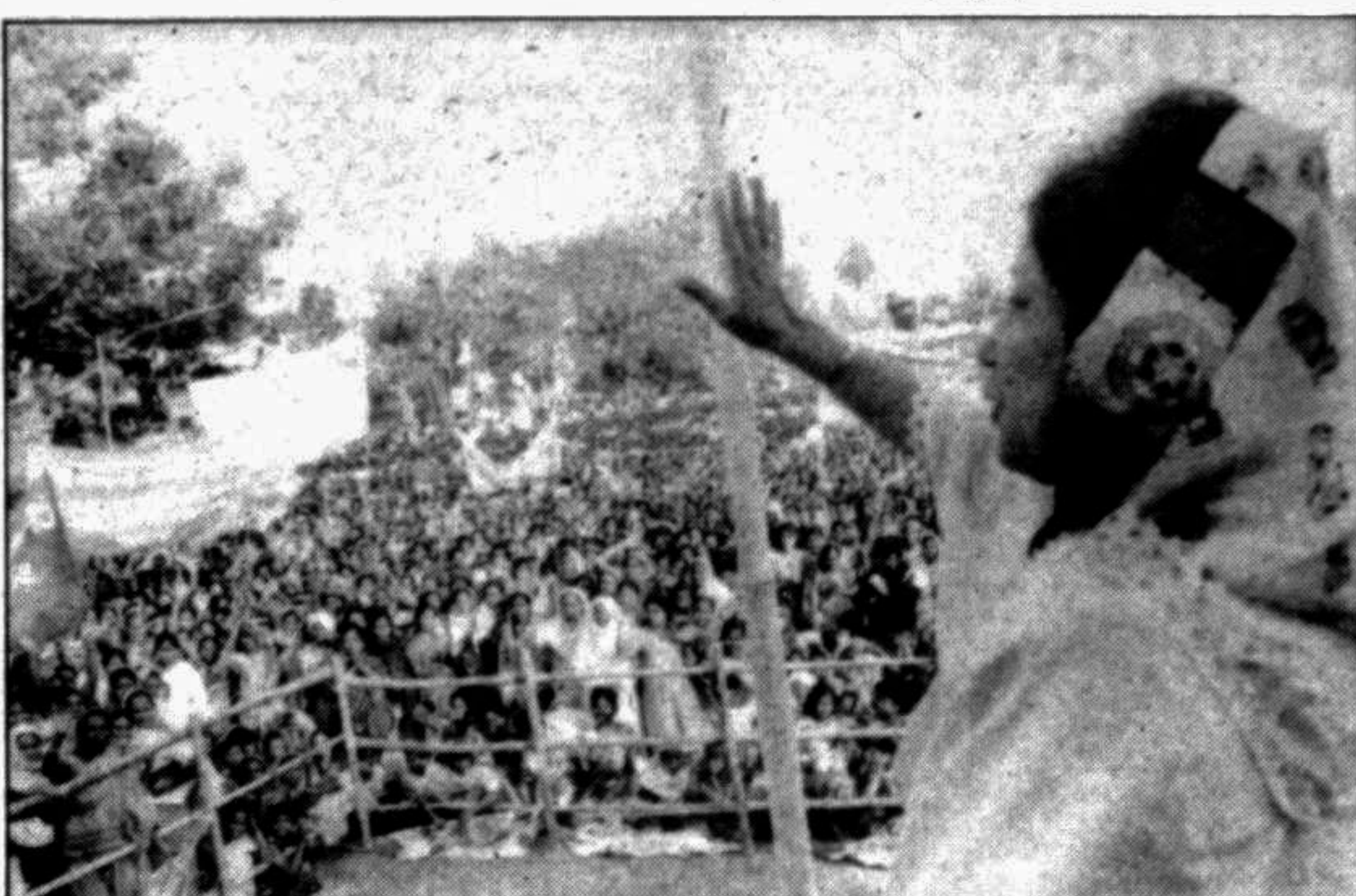
Prime Minister Begum Khaleda Zia addressing a public meeting at Eidgah Maidan in Jessore yesterday.