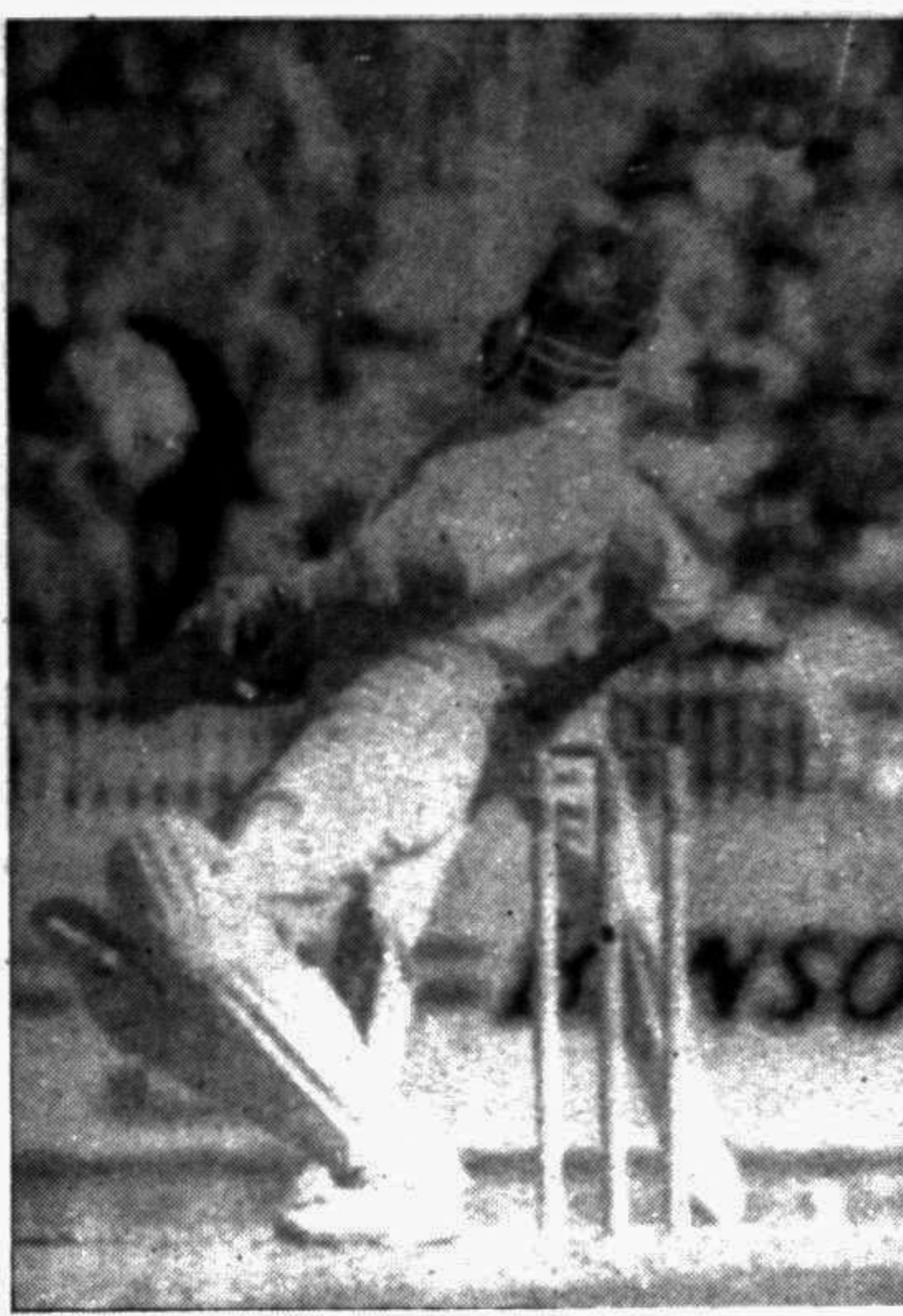
Mark Waugh of Australia evades a lifter from West Indian pacesman Curtly Ambrose on the first day of the second Test between West Indies and Australia at the Melbourne Cricket Ground yesterday. Waugh scored a defiant 63 as the Aussies made 227 for four at stumps.

All members and officials of the association have been requested to attend the meeting.