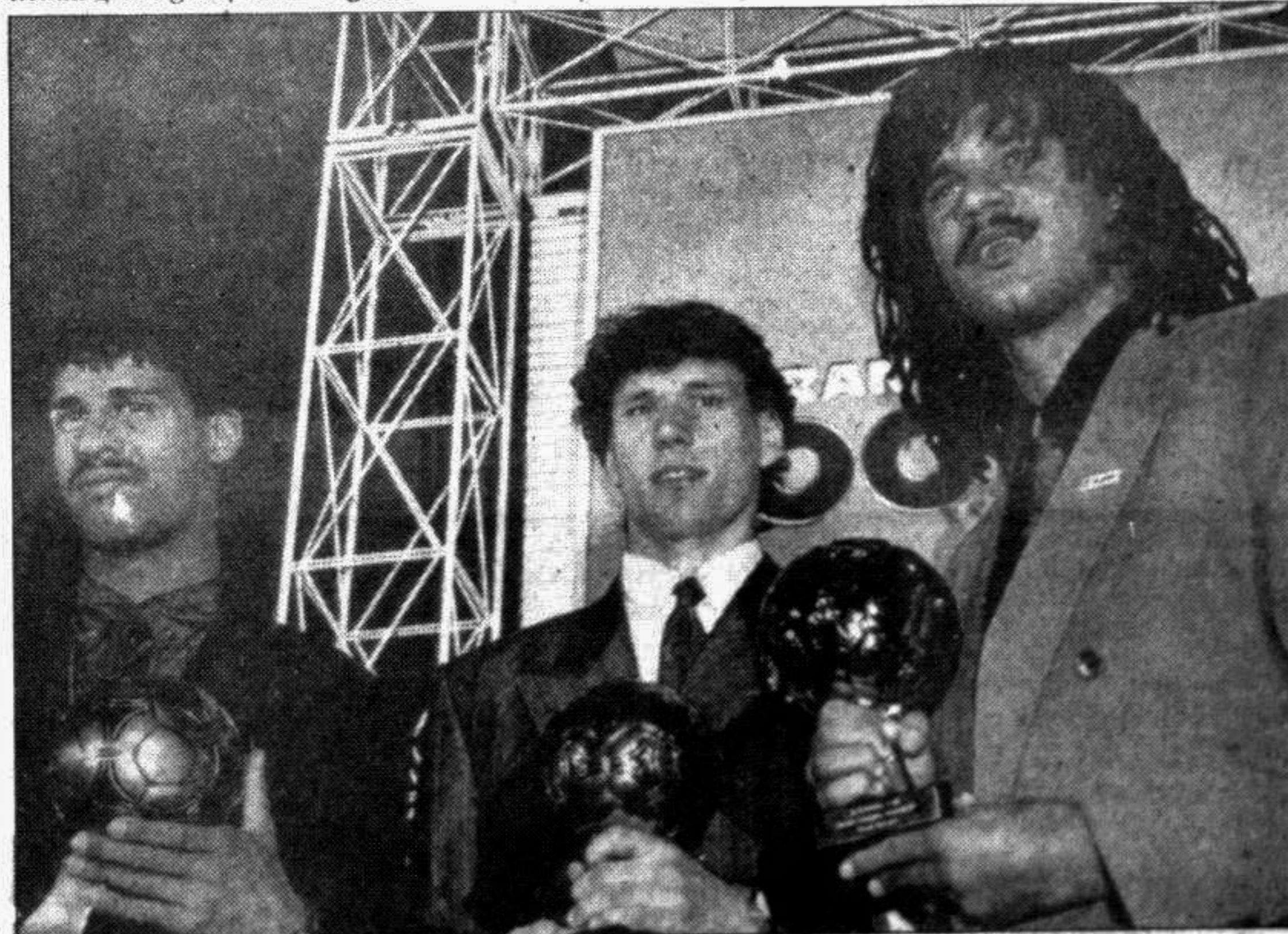
AC Milan's fearsome Dutch threesome: From left: Frank Rijkaard, Marco van Basten and the redoubtable Ruud Gullit.

The downside is that the wrangling over the transfer looks set to drag on through