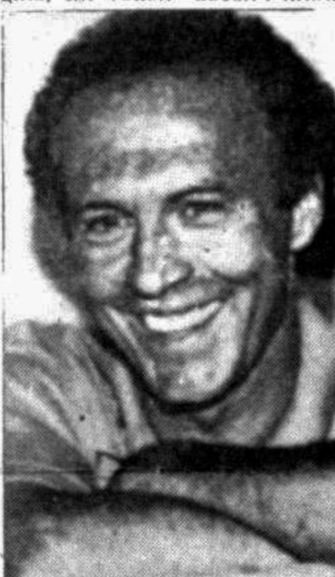
FRANZ BECKENBAUER the real performance level of his team," he said.

"When the tournament begins, the coach doesn't know