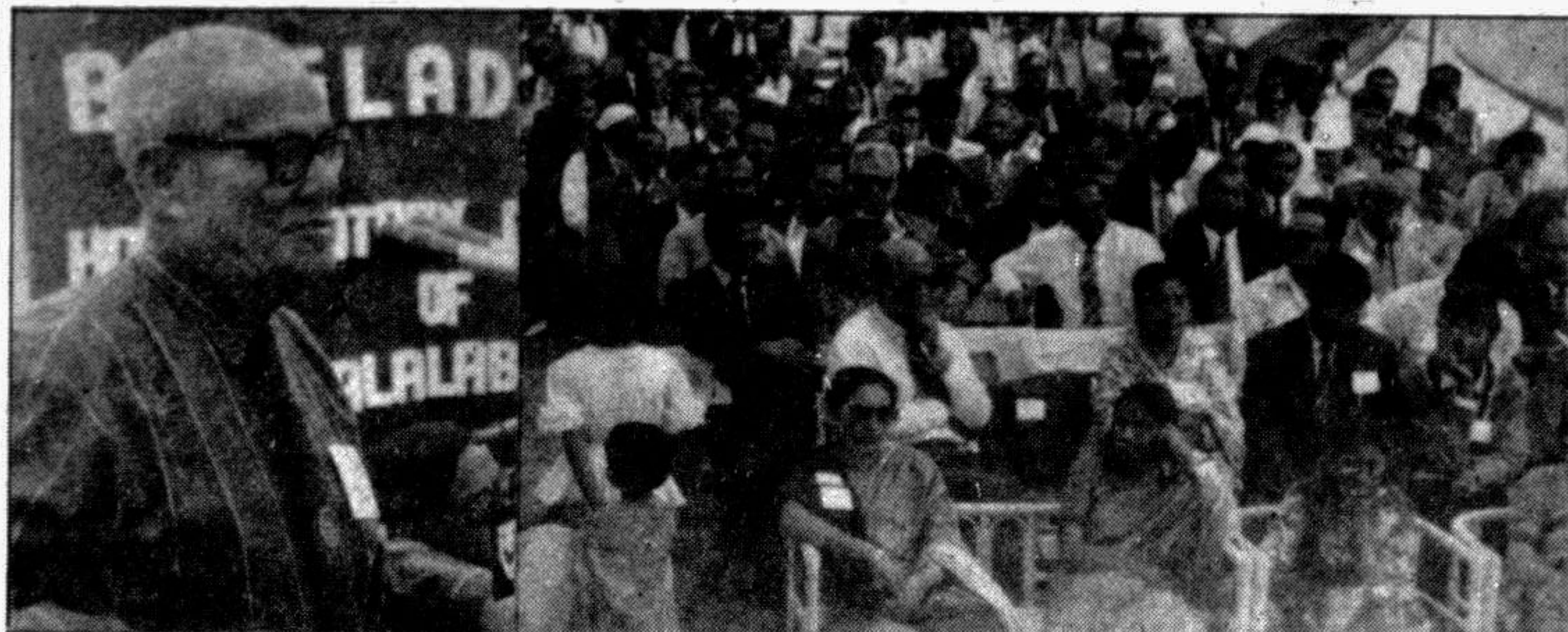
SYLHET: Deputy Speaker of the Jatiya Sangsad Humayun Khan Panni speaking as chief guest at the inaugural session of the second day inter-city meeting of Rotary clubs hosted by the local Rotary Club at the Lackatoora Golf Club recently.

They demanded proper enquiry into the matter and urged the Railway authorities to take proper steps to mitigate the sufferings of the passengers.