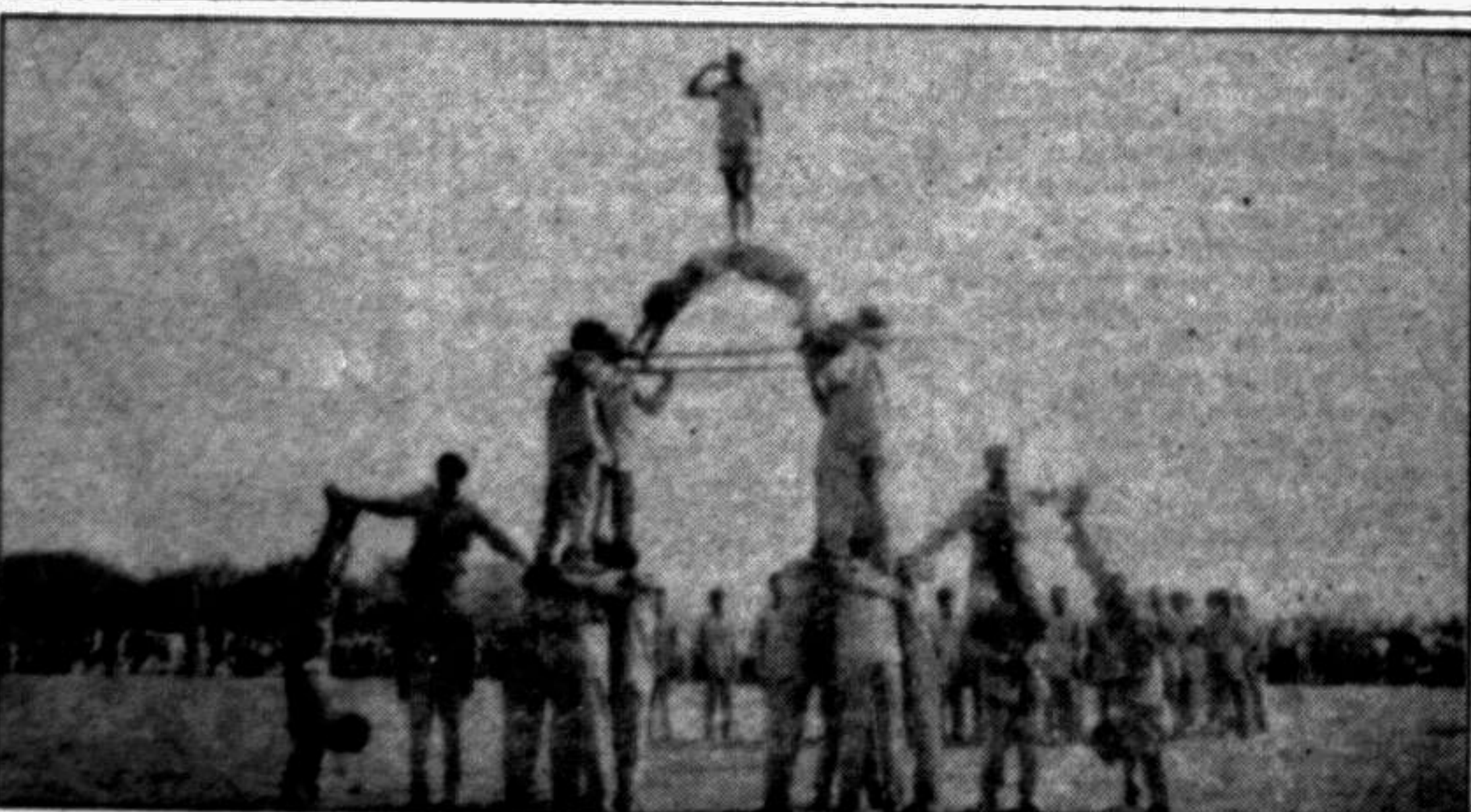
CHANDPUR: Orphan boy scouts arranged a man-made bridge on the occasion of Victory Day rally held here at local stadium recently.