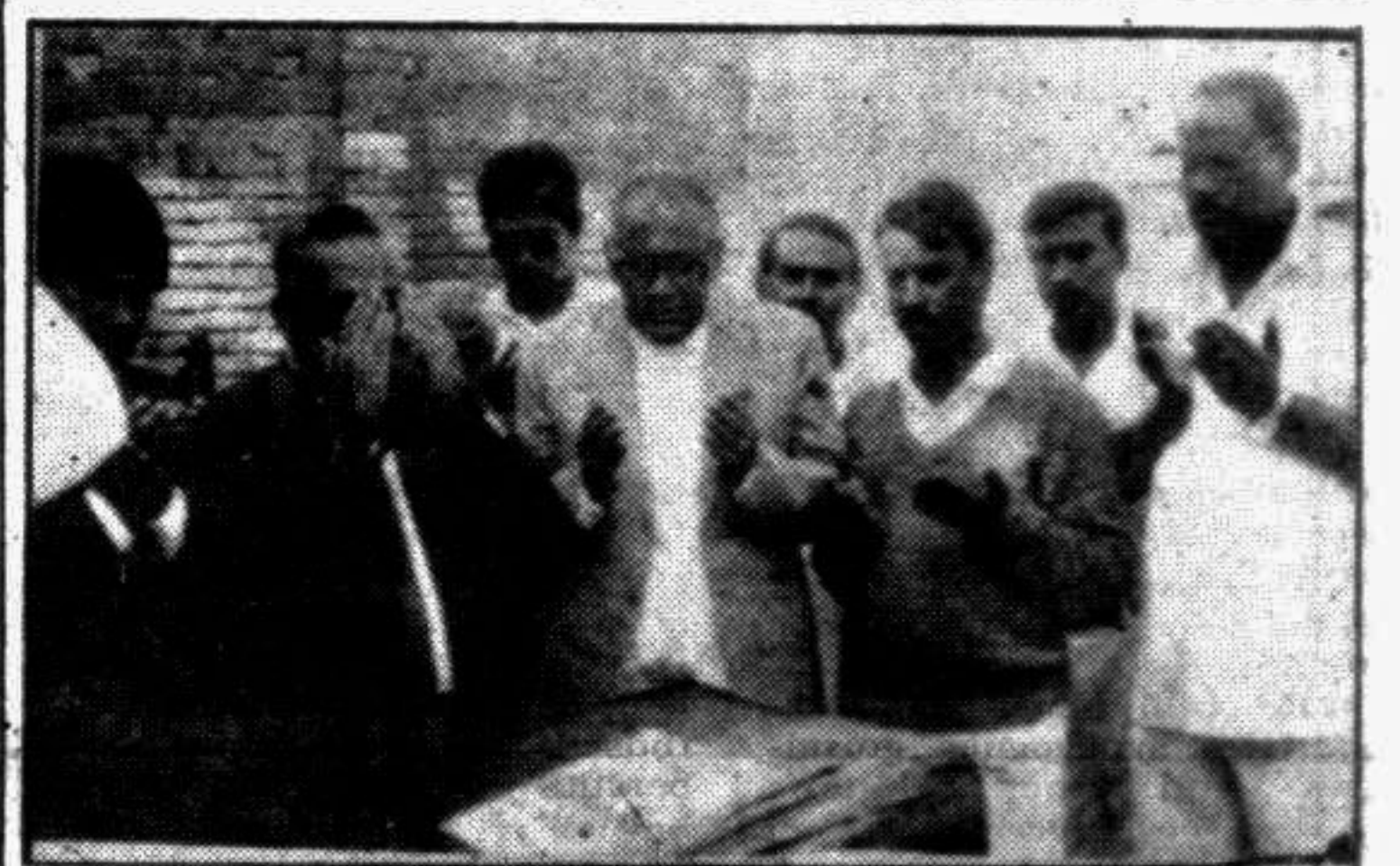
KURIGRAM: Foundation laying ceremony of Kurigram Red Crescent Market.