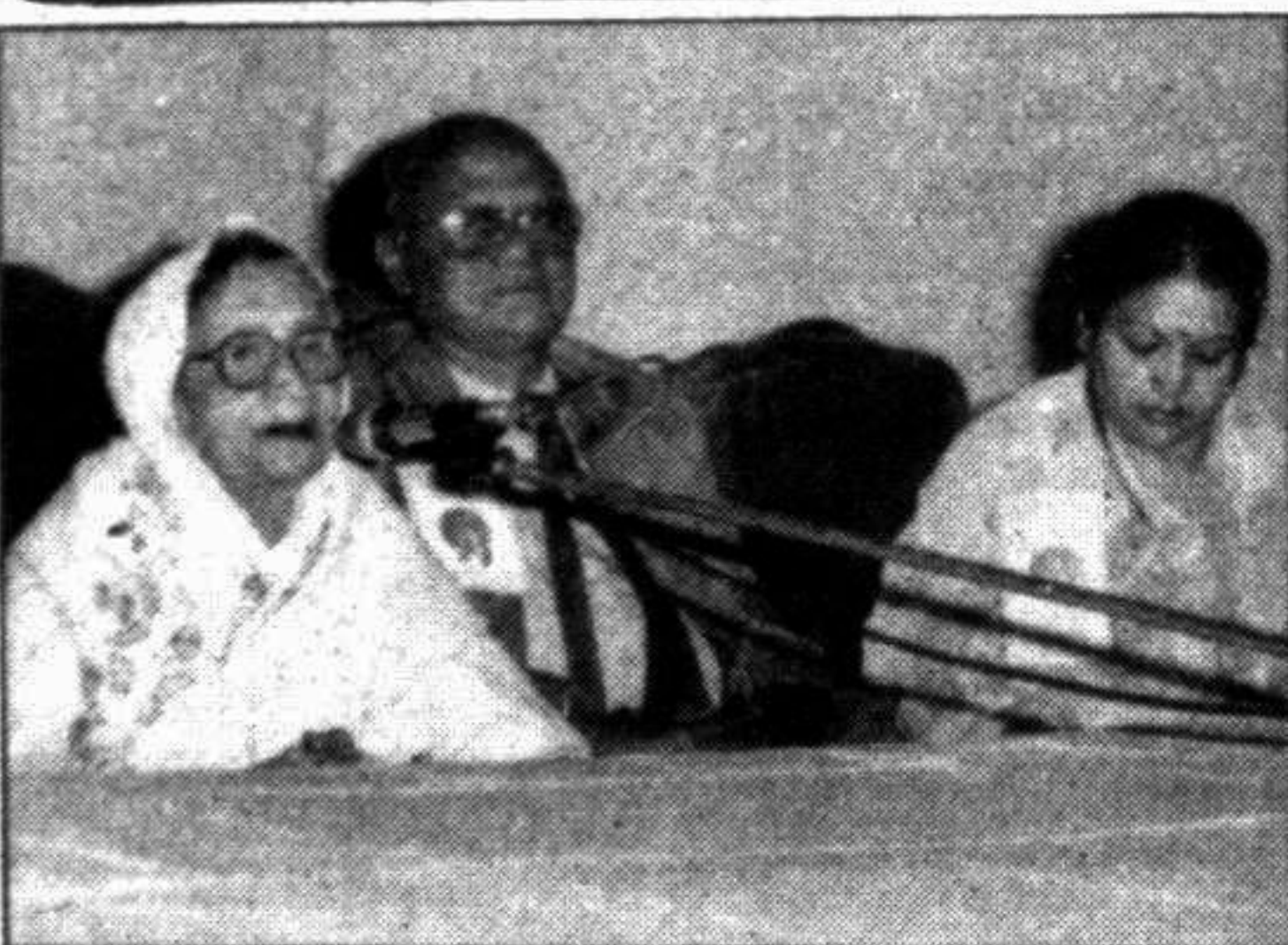
Poet Sufia Kamal addressing a discussion meeting on "Bangabandhu and Bangladesh" at the National Press Club auditorium yesterday. Story on Page 12