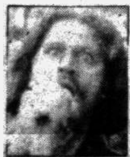
Snake charmer for 34 years Page 3