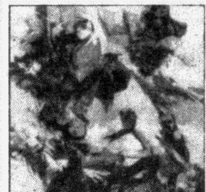
Artist: Qayyum Choudhury

The 10th National Art Exhibition 1992 begins at Shilpakala Academy in the capital today (Monday).