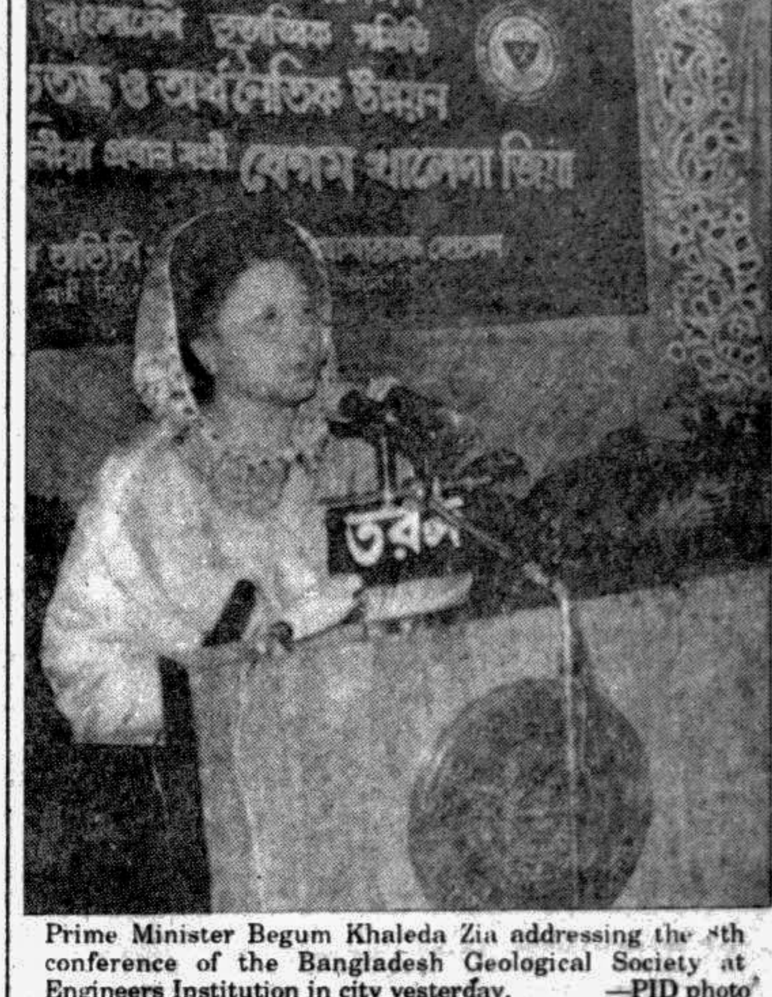
Prime Minister Begum Khaleda Zia addressing the 8th conference of the Bangladesh Geological Society at Engineers Institution in city yesterday.

MEDINA, Dec 20: Saudi Arabia and Qatar reached an agreement Sunday for settling their border dispute after three days of mediation by Egyptian President Hosni Mubarak, reports AP. Mubarak has been locked in talks with Saudi Arabian King Fahd and the emir of Qatar, Sheik Khalifa bin Hamad Al Thani, for the past two days in the holy city of Medina. The agreement follows a three-month rift between the Arab nations that opened after a Sept. 30 border clash killed two people. The official Qatar News Agency announced the agreement, but provided none of its details. The agency said the agreement was signed by the foreign ministers of the three countries: Sheik Mohammed Bin Jasim al Thani of Qatar, Prince Saud al-Faisal of Saudi Arabia and Amr Moussa of Egypt. It said the signing took place in the presence of the