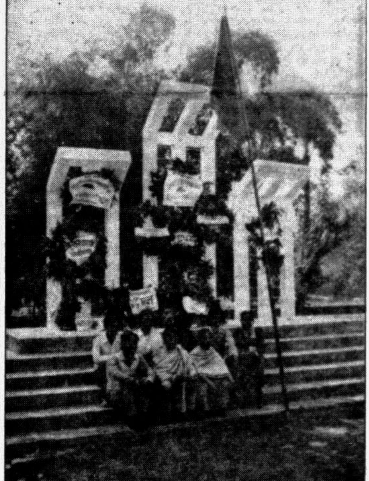
MAULVIBAZAR: The local central Shaheed Minar where 23 Freedom Fighters were buried.