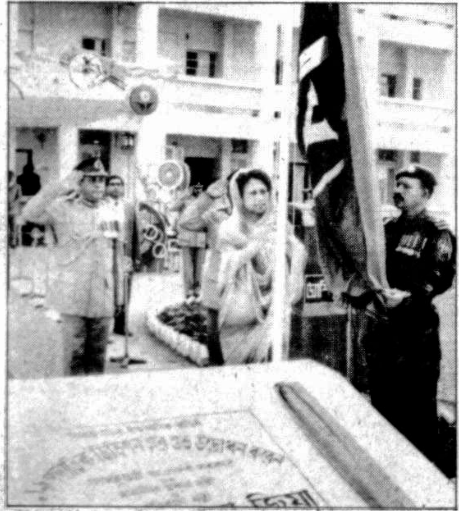
Prime Minister Begum Khaleda Zia inaugurating the flag raising ceremony of a new division of the Bangladesh Army at the Mymensingh Cantonment.

She hoped with the raising of the new division Mymensingh would gradually prosper.