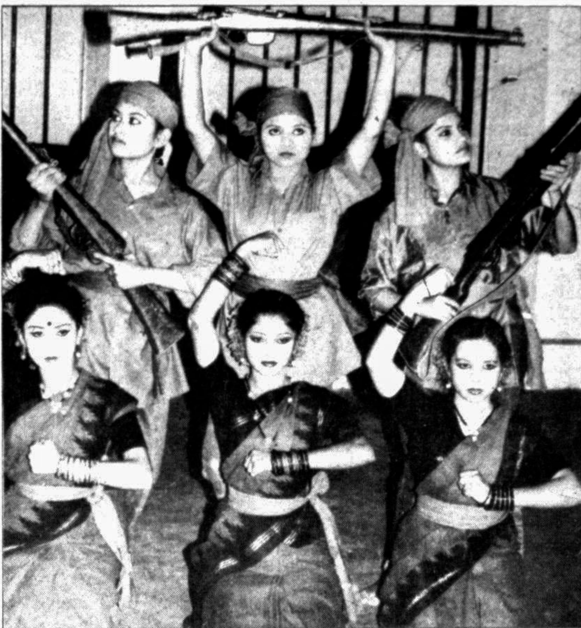
A sequence of dance of Natoraj Shilpi Goshti at Central Shaheed Minar yesterday organised by Shammilita Sangskritik Jote.

For the Muktijoddhas and the families of the martyred the problem is, basic survival. They do not have great expectations from a country they staked their lives for. They just want to live like human beings.