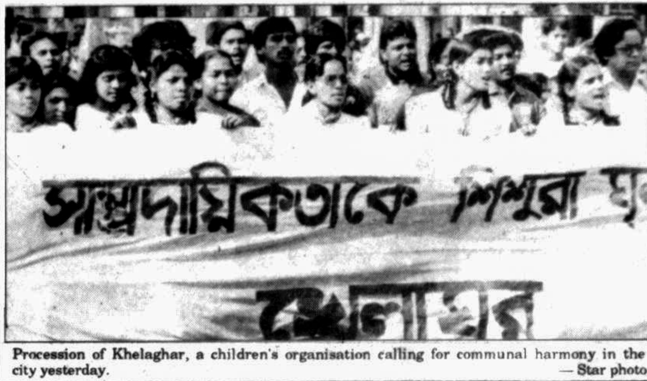
Procession of Khelaghar, a children's organisation calling for communal harmony in the city yesterday.

105, AGRABAD COMMERCIAL AREA, CHITTAGONG. AS AGENTS: MITSUI O.S.K. LINES LTD., TOKYO. PHONES: 503517, 500669/88.