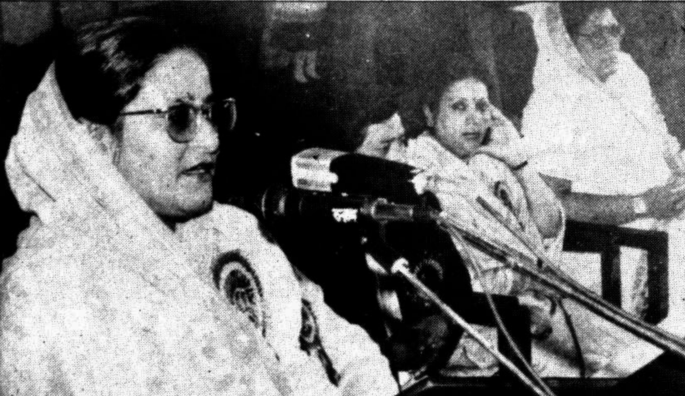
Sheikh Hasina speaking at a discussion organised by Bangabandhu Sangskritik Jote at Engineers Institution in city yesterday.