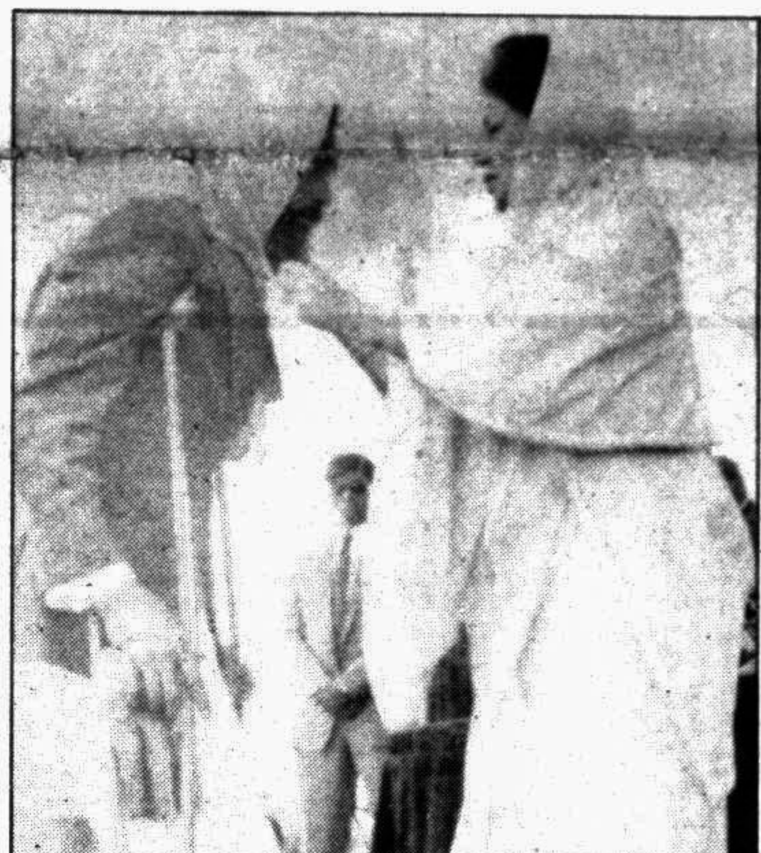
Prime Minister Begum Khaleda Zia distributing gallantry awards to the valiant freedom fighters of the War of Liberation at North Plaza of the Jatiya Sangsad Bhaban yesterday.