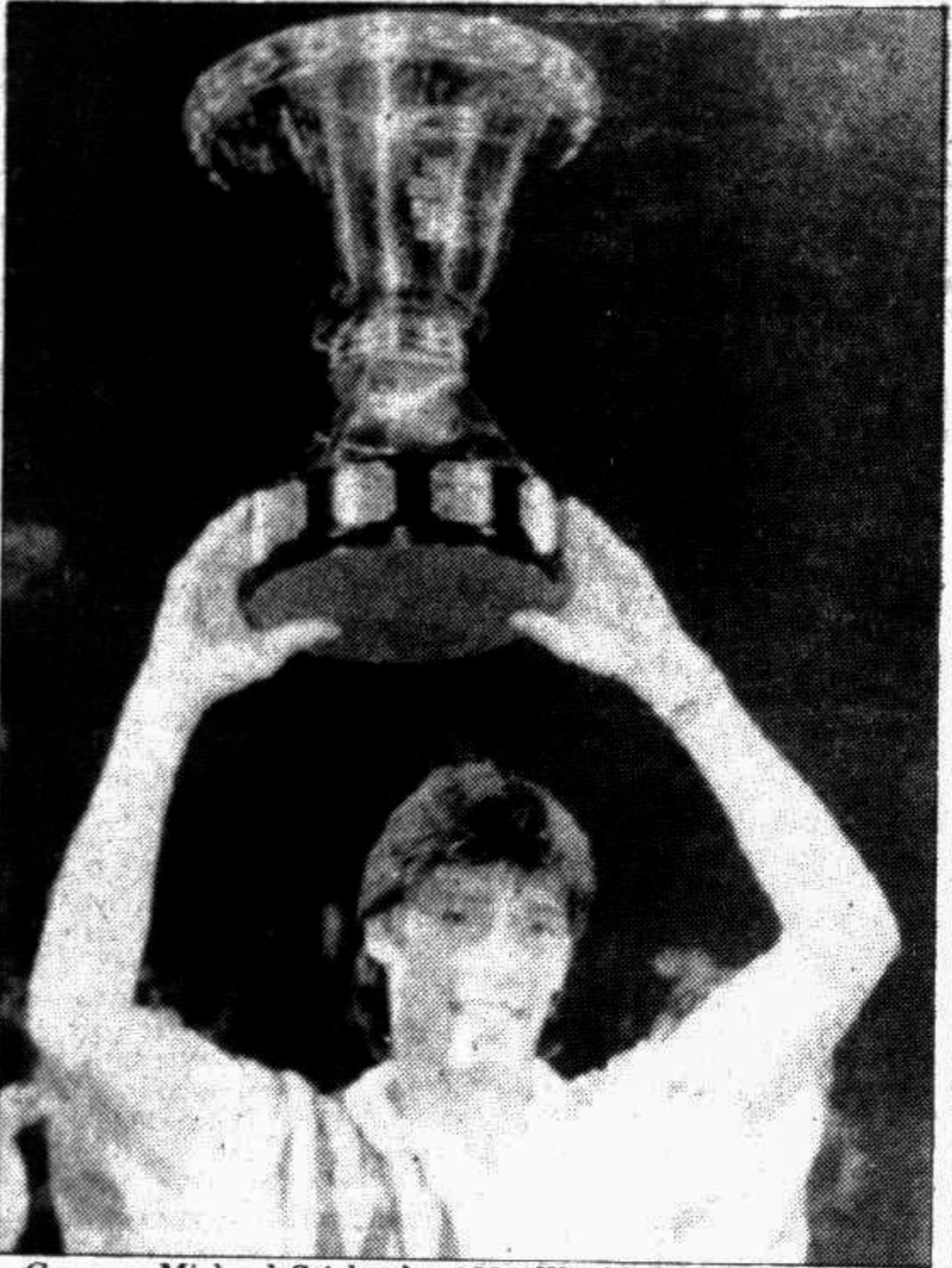
German Michael Stich, the 1991 Wimbledon winner, with the Compaq Grand Slam Cup after outplaying American Michael Chang 6-2, 6-3, 6-2 in the final at the Munich Olympic Hall on Sunday. Stich is the only non-American to clinch the trophy since it commenced in 1990.

Chang, who beat Stich in the quarter-finals of the EC Championships in Antwerp, still pricked up one million pounds for his troubles.