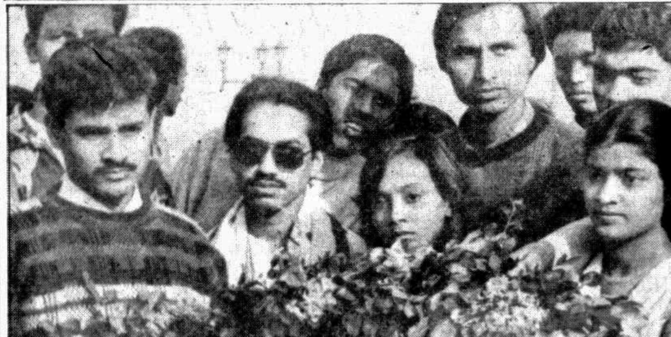
From top: (1) BNP placing wreaths at the Martyred Intellectuals Memorial at Mirpur (2) Awami League (3) Ghatk Dalal Nirmul body (4) DU VC and DUCSU (5) Bangladesh Democratic Forum (6) Five-Party Alliance and (7) Projonmo '71.