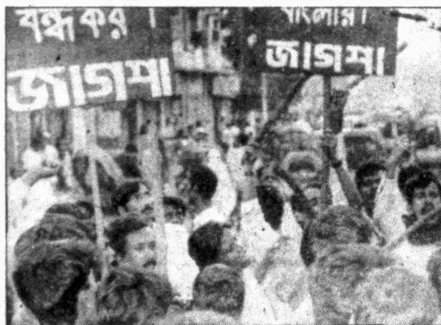
JAGPA procession in the city yesterday to protest the demolition of Babri Mosque in India.

The meeting appealed to all sections of people to maintain peace and harmony among different communities. It decided to hold a peace procession tomorrow.