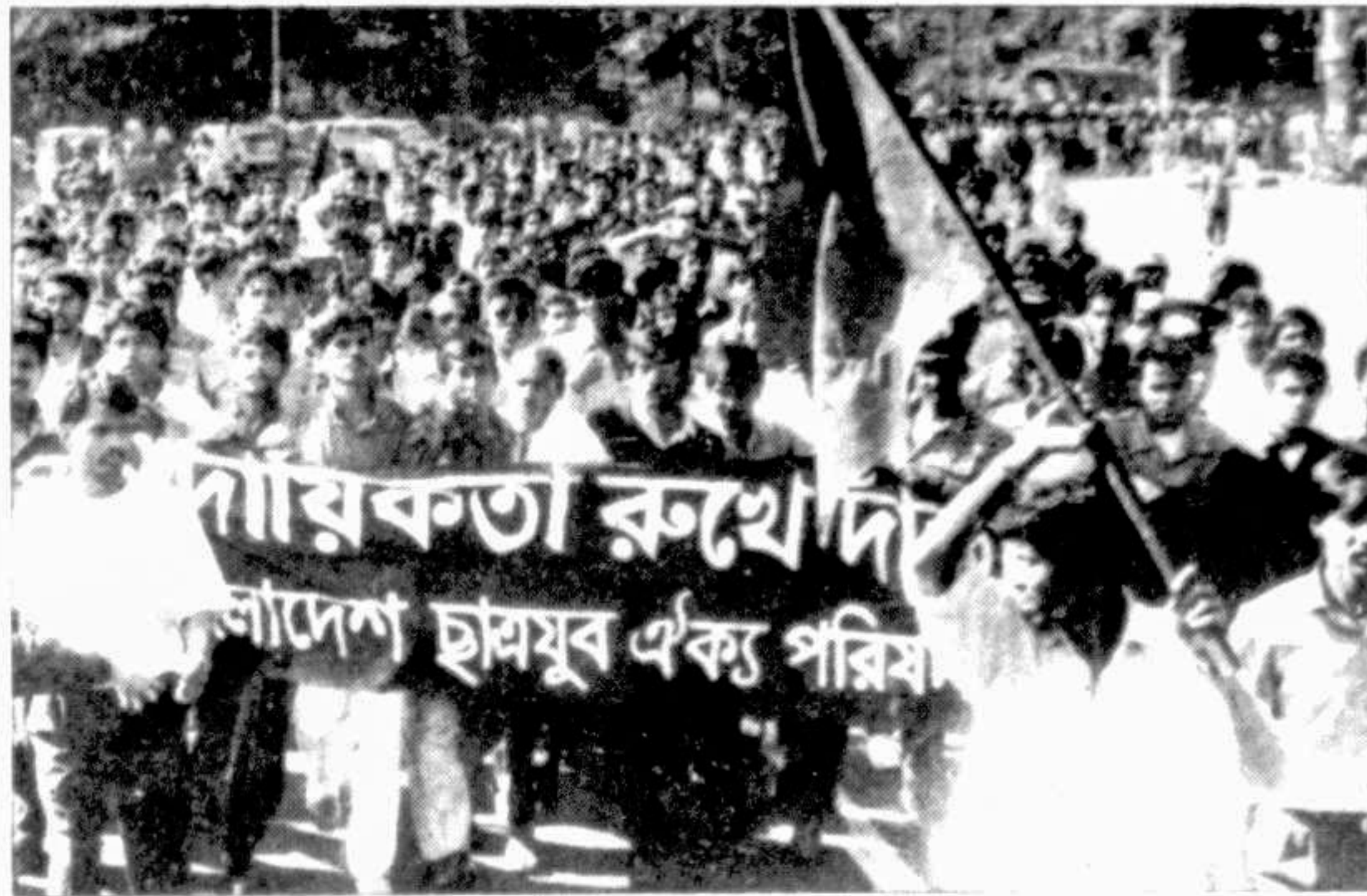
Chhatra Jubo Oikya Parishad brought out a procession in the city yesterday calling for communal harmony.

"From what I heard, on the morning of 13th December a few Bengalee men came to pick her up, saying they had some urgent matters to discuss. When her younger brother and son insisted to accompany her, they promised to bring her back soon..."