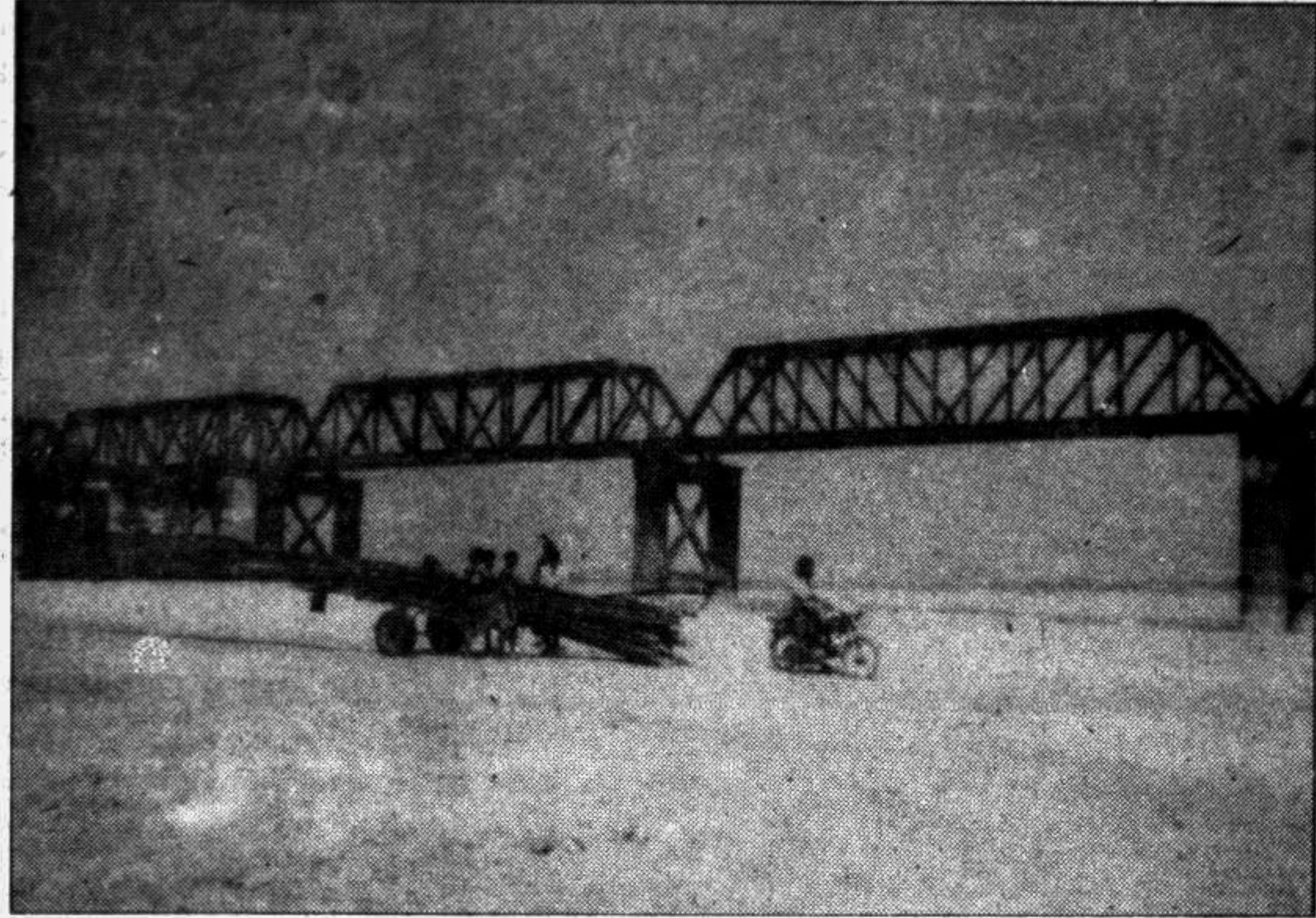
SILTATION OF RIVERS: The bridge site on the river Gorai. It is difficult to believe that once steamers and launches used to ply below the bridge. During summer, pushcarts, rickshaws and other vehicles ply on the bed of the river.

Dec 9: A man of Kulaura town of the district has been awarded life-term and fined Taka 5,000, in default to suffer one year rigorous imprisonment more, reports UNB. The prosecution story, in brief, was that accused Dulal Miah killed an employee of Rainbow Bread and Biscuit Factory of Kulaura town on April 30, 1990 following a previous enmity. District and Sessions Judge Mahmud Hasan Siddiqui after examining the witnesses and records delivered the judgement last week.