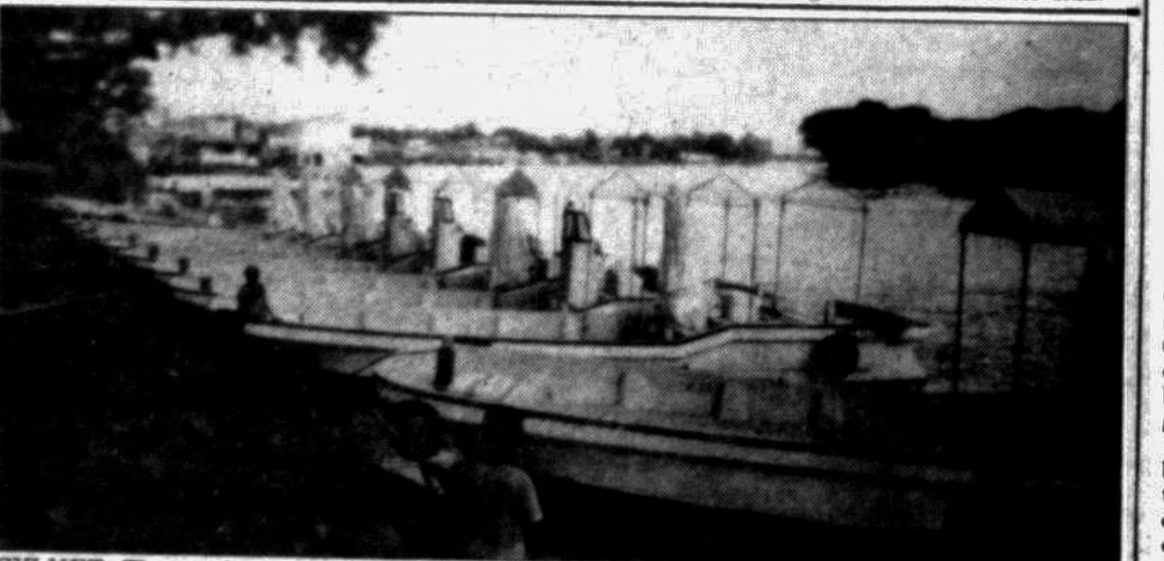
SYLHET: The mechanised boats have been lying under open sky which were brought here for relief work during the last flood.