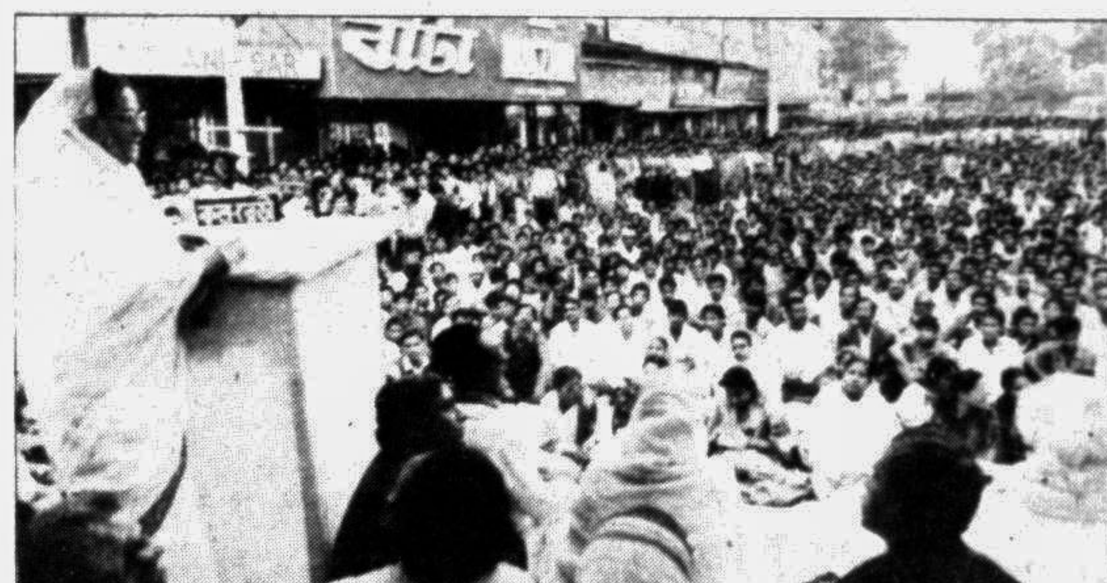
Sheikh Hasina addressing a rally at Bangabandhu Avenue yesterday.