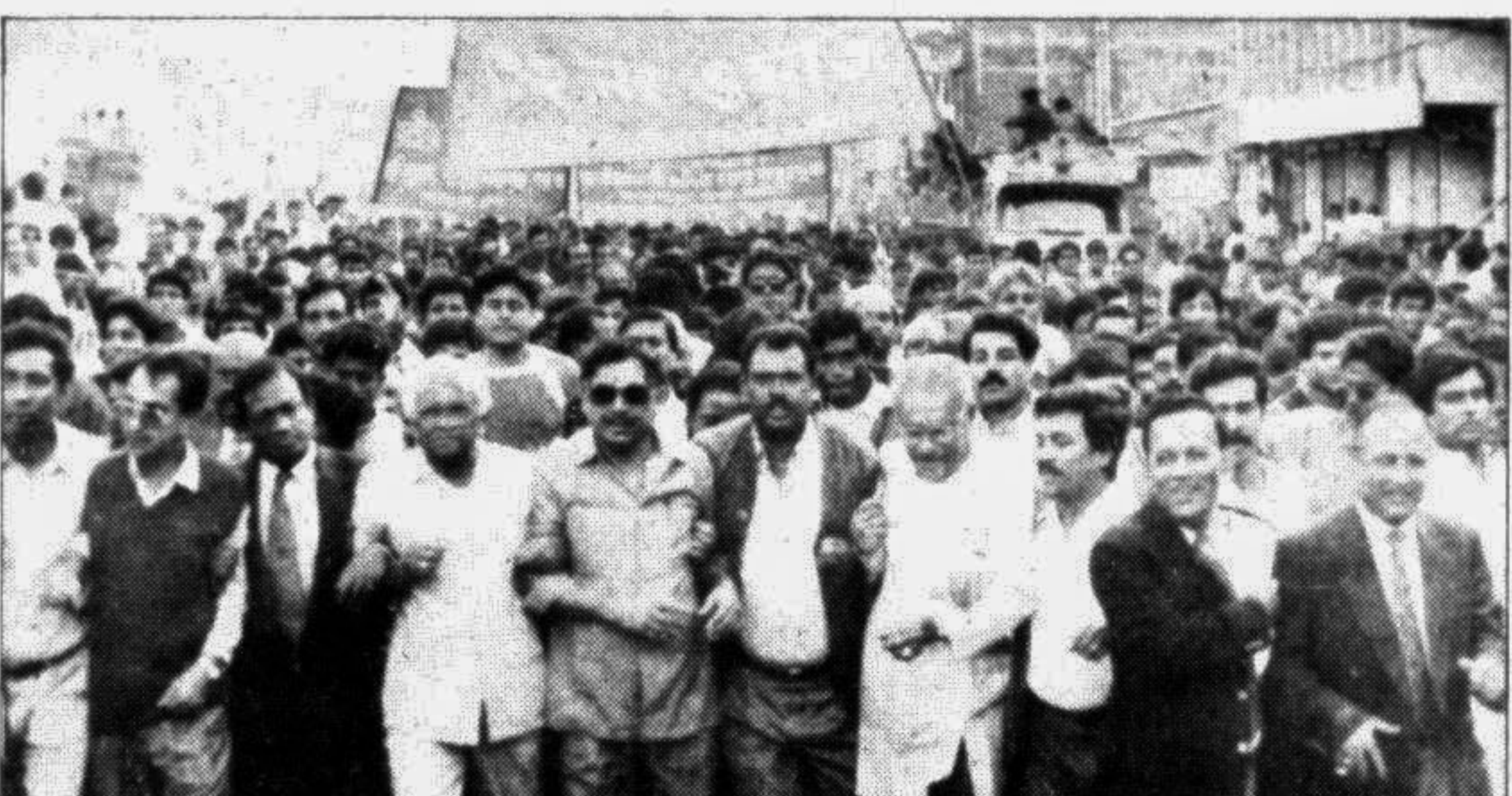
Dhaka city BNP yesterday brought out a procession calling for maintaining communal harmony.