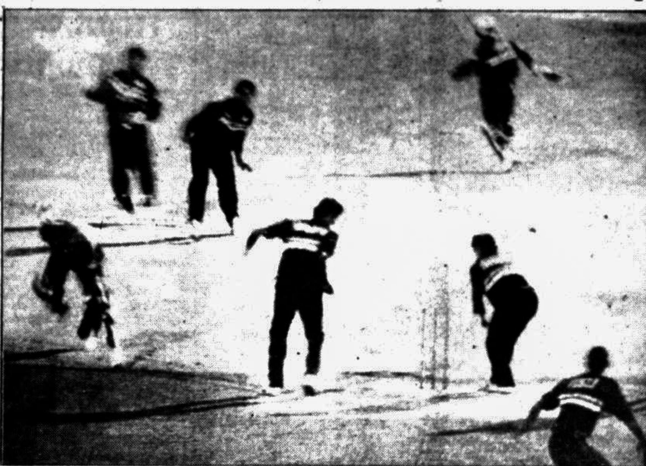
A BORDER LINE CASE: South African captain Kepler Wessels caught in a desperate attempt to reach the crease with the throw about to hit the stumps at the bowler's end. Wessels made 43 as his side beat India by six wickets in the first one-dayer in Cape Town on Monday.

Though the IOC's rules would only apply at Olympic Games, the Swiss-based body has long been urging international federations to follow its lead and standardise dope test regulations and penalties.