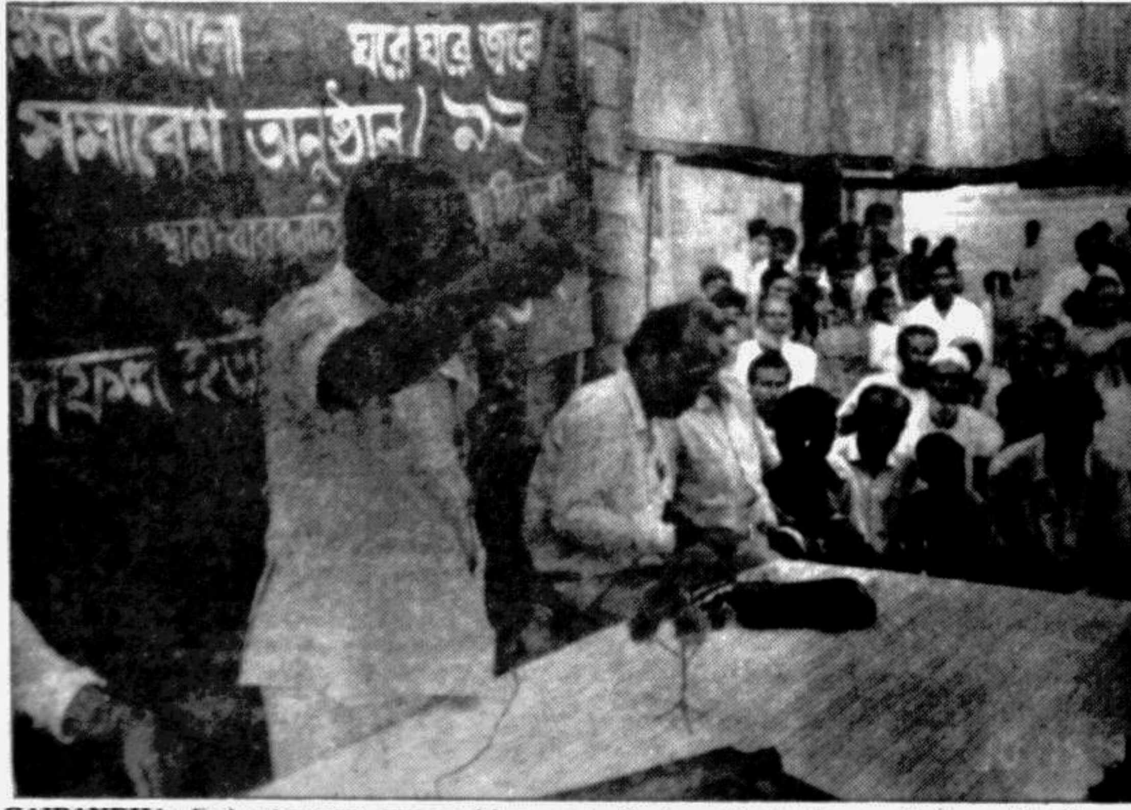
GAIBANDHA: A meeting was arranged here recently to motivate the people in eradicating illiteracy from the district.