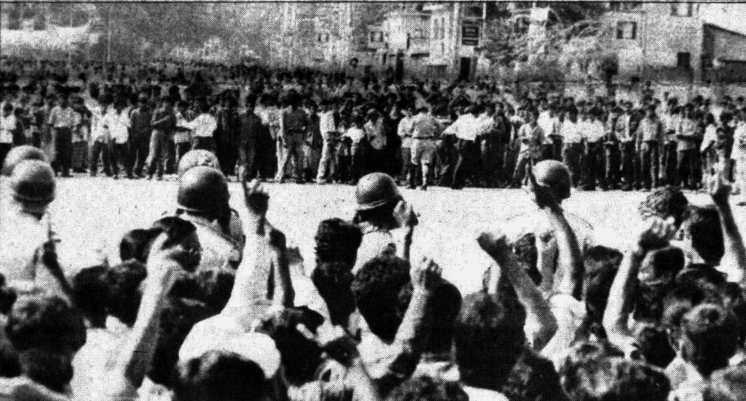
Bangabandhu Avenue during hartal hours (top) and policemen acting as buffers as Nirmul body men and Jamaat activists confront one another near Paltan crossing in the city (above) yesterday.