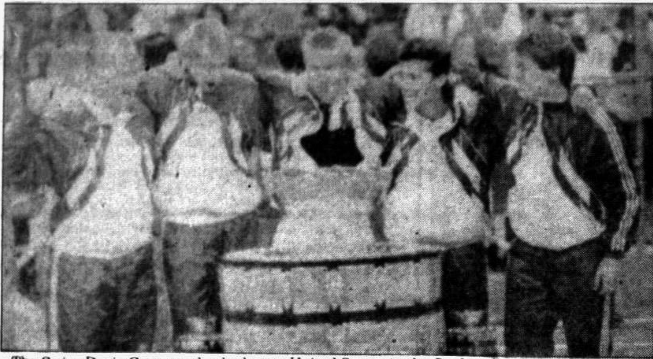
The Swiss Davis Cup squad, who lost to United States in the final on Sunday, poses with the championship trophy after the awards ceremony. Jim Courier, the world number one, beat Jakob Hlasek in the reverse singles to make it an unbeatable 3-1 in his country's favour.