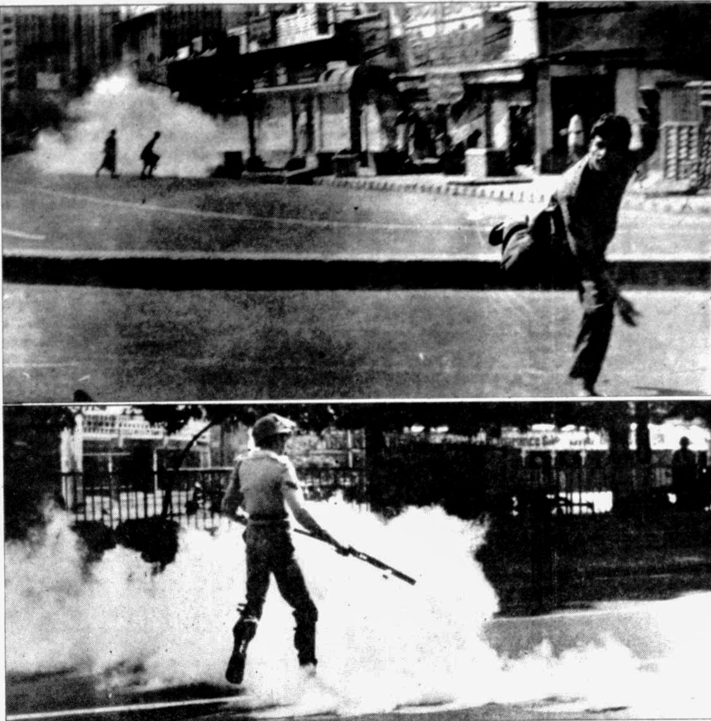
Clash in city over demolition of Babri Mosque. Demonstrators pelting stones at police (top) Police lobbing teargas shell at the mob (above).