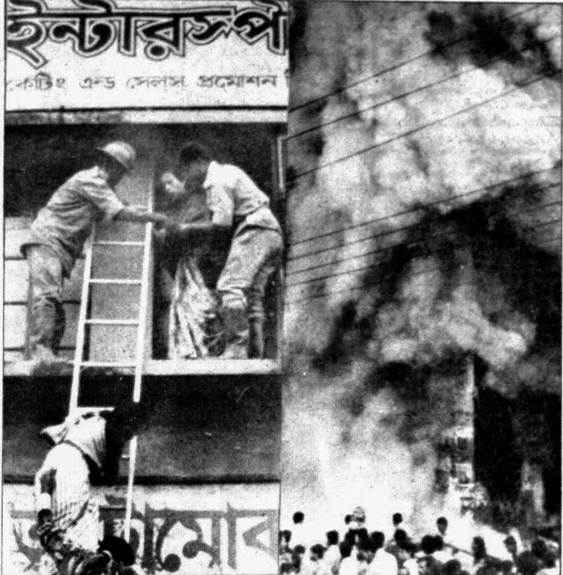
Fire Service men rescuing Indian Airlines women from the airlines office in the downtown Dhaka (left) moments before the office was set ablaze (right) by mobs protesting Babri Mosque demolition yesterday.

Cabinet condemns A special cabinet meeting was held yesterday with Prime Minister Begum Khaleda Zia in the chair to consider the situation arising from the destruction of the Babri Mosque in Ayodhya in India, reports UNB. The cabinet unequivocally and in the strongest terms expressed its condemnation of the demolition of the more than 400-year-old Mosque and those responsible for the incident. The cabinet also expressed its sympathy for the Hindu community, has sown the seeds of distrust and divisiveness," the conservative Times of India said in a front-page editorial. In Parliament, opposition legislators criticized Prime Minister P V Narasimha Rao for failing to prevent the storming, which was announced a month ago by the Hindu groups. Despite calls for his resignation, Rao's position as head of state and leader of the Congress Party did not appear to be threatened immediately. In Ayodhya, thousands of Hindus started the construction of a temple on the site of the fallen mosque. By nightfall, they had built a 1,225-