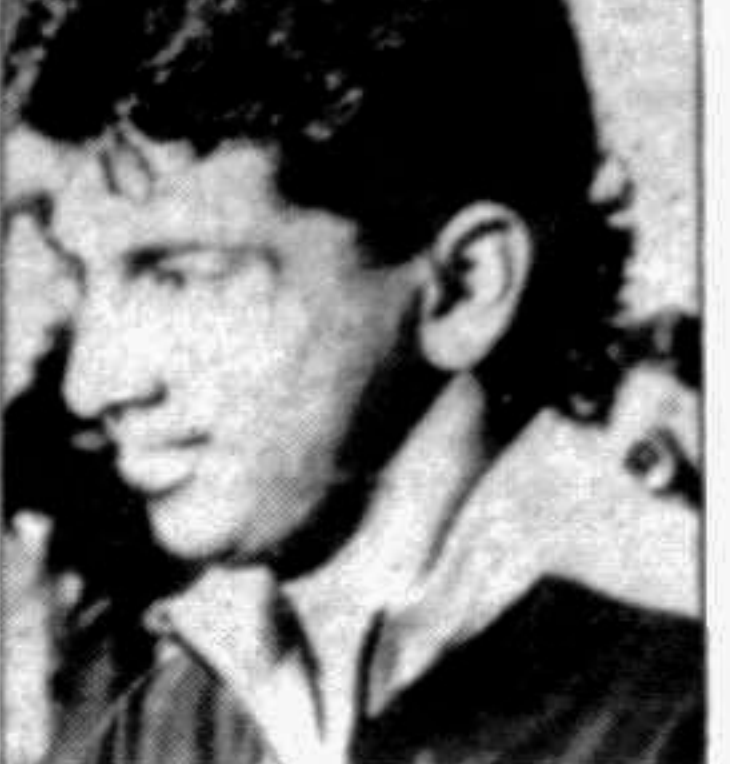
R MAHANAMA... 109

Ranatunga's hopes for his fourth Test hundred disap-