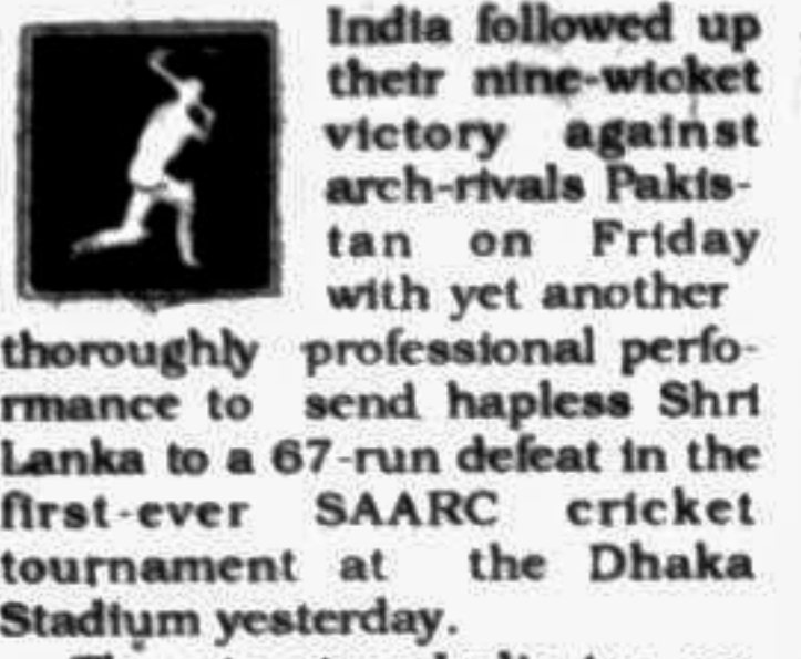
India followed up their nine-wicket victory against arch-rivals Pakistan on Friday with yet another thoroughly professional performance to send hapless Sri Lanka to a 67-run defeat in the first-ever SAARC cricket tournament at the Dhaka Stadium yesterday.