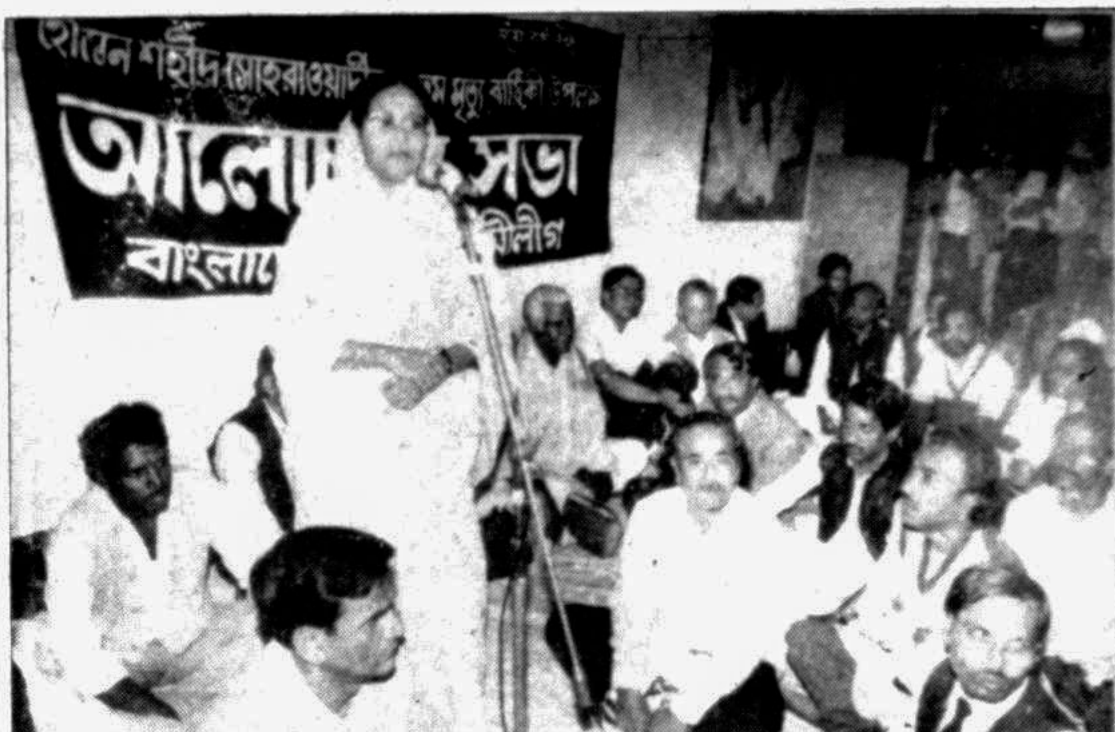
Sheikh Hasina speaking at a discussion meeting in observance of the 29th death anniversary of H S Suhrawardy at Awami League central office yesterday.

They are demanding a fresh waiting list for candidates seeking admission into eleven class on merit basis.