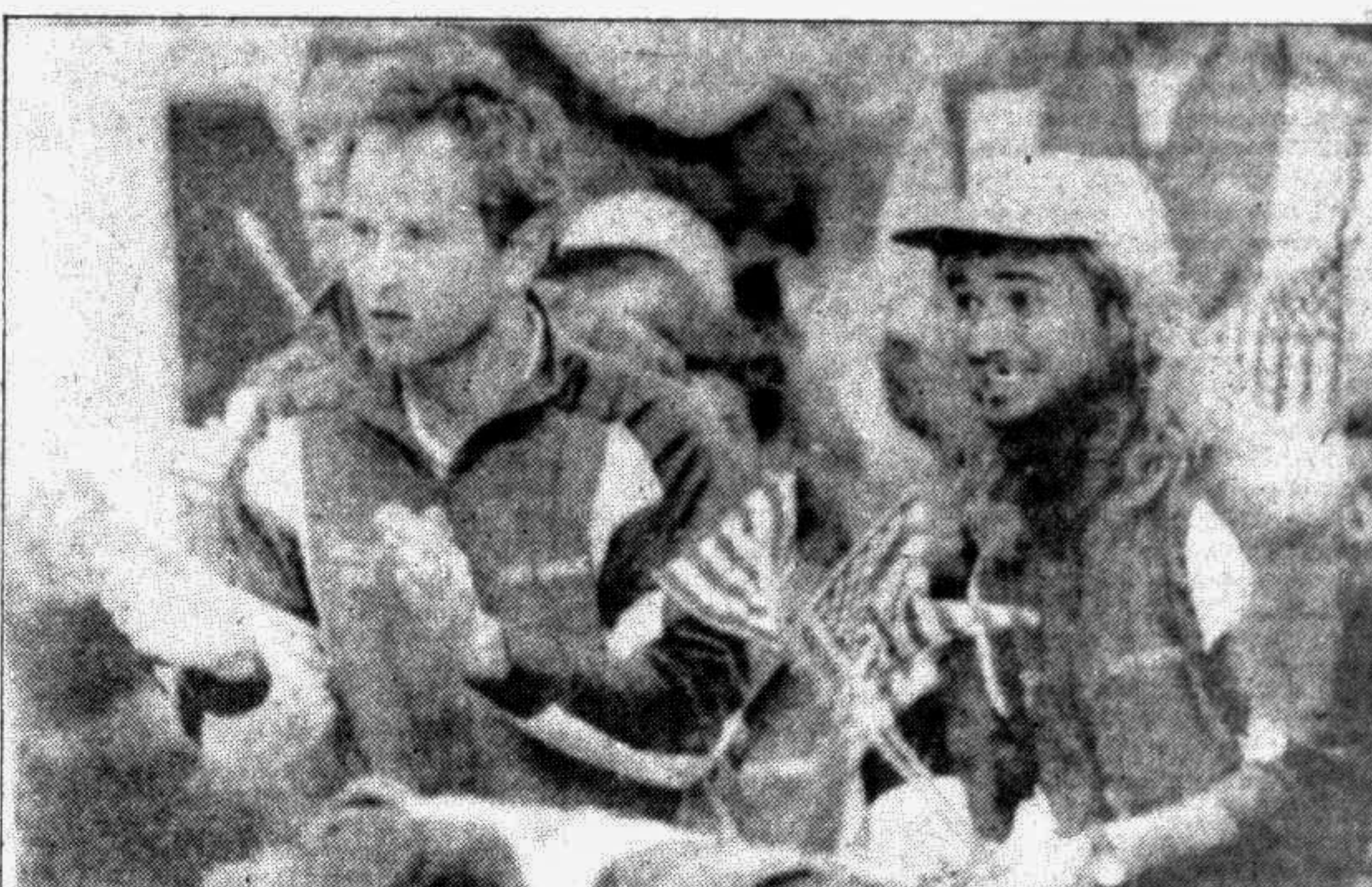
Americans John McEnroe and Andre Agassi cheer on teammate Jim Courier, the world number one, as he battles Swiss Marc Rosset in the second singles of the Davis Cup final at Fort Worth on Friday. But that wasn't enough as Rosset rallied to win the tie.

Courier then dug down and appeared to be on the verge of