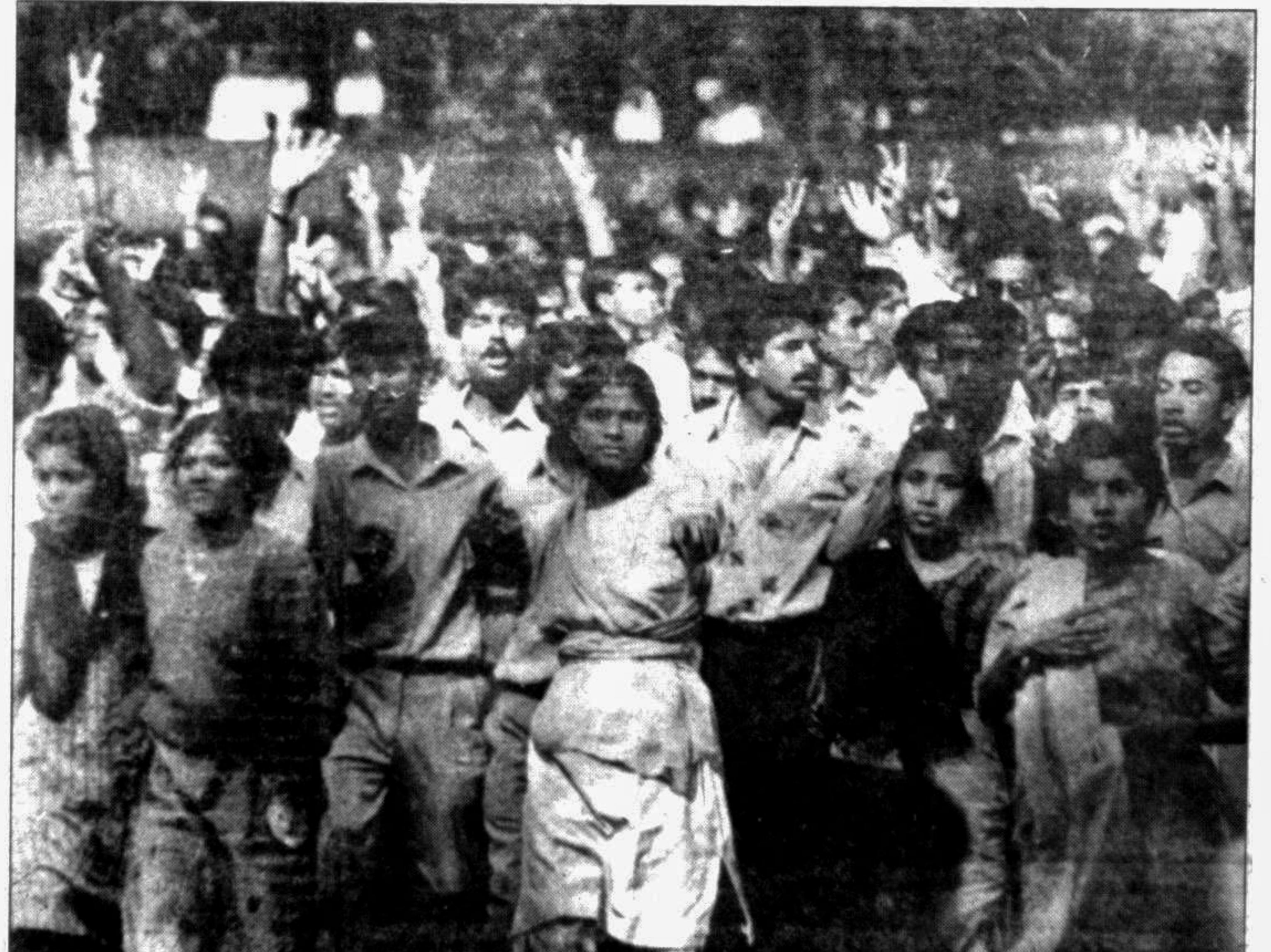
Defying the odds: Dhaka University girls lead the first demonstration to break emergency regulations in the city on Nov 28, 1990.