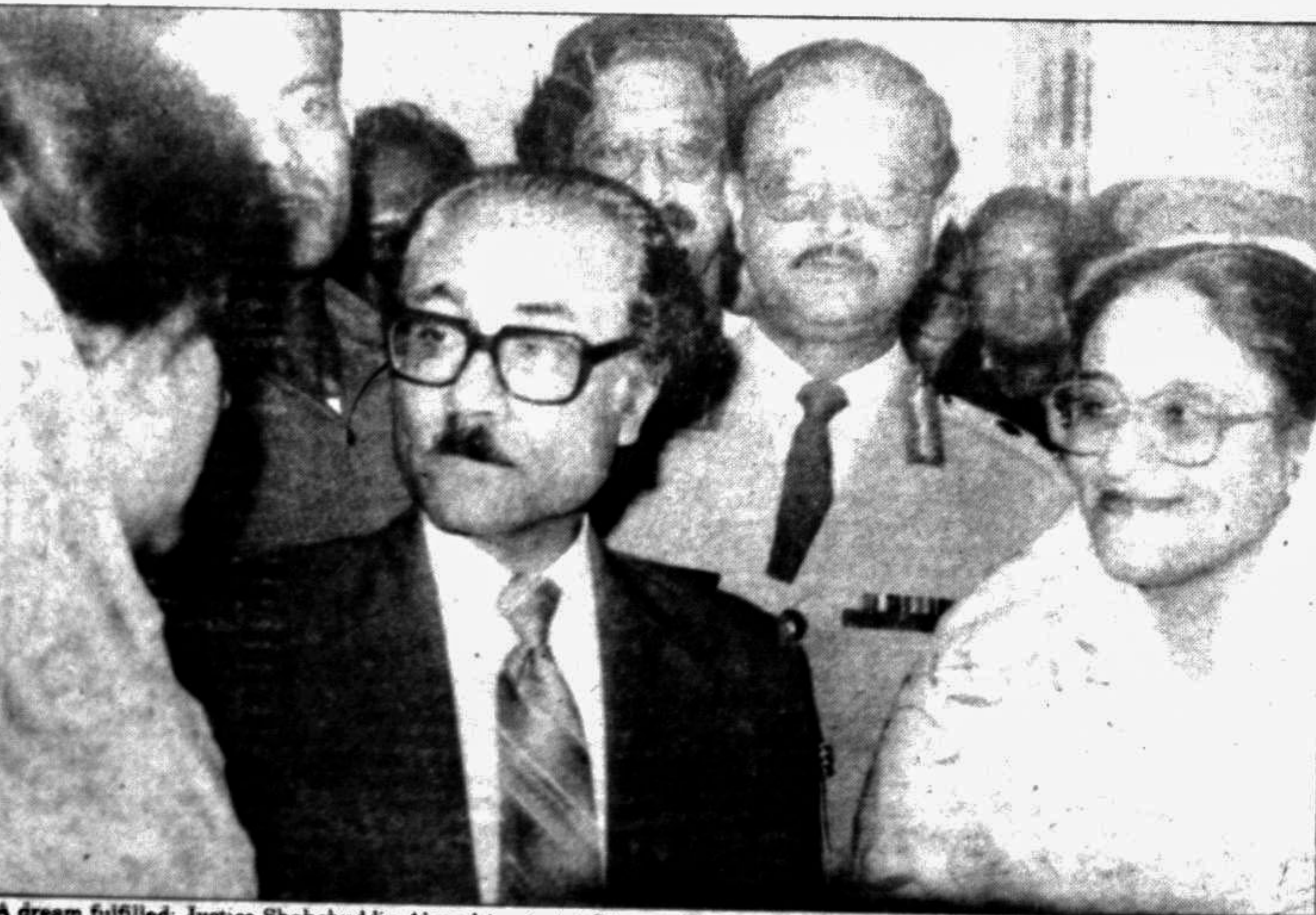
A dream fulfilled: Justice Shahabuddin Ahmed (centre) talking to Khaleda Zia (left) and Sheikh Hasina after taking over as the acting president Dec 6, 1990.