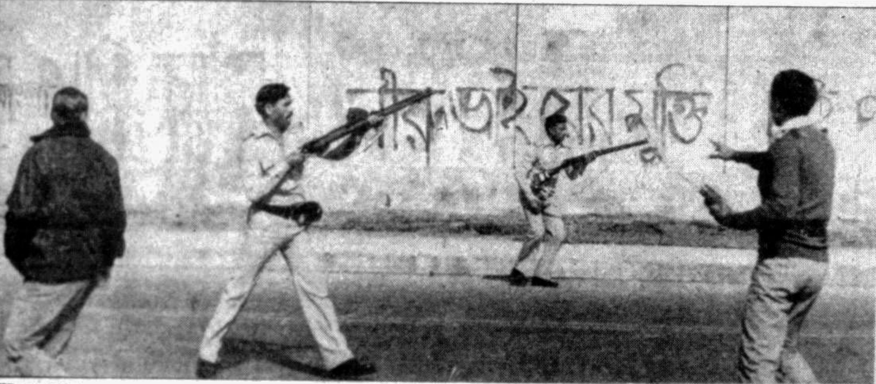
Where did they go?: Guns at the ready, policemen take position near the Dhaka University campus, waiting for student demonstrators to re-emerge, 1985.