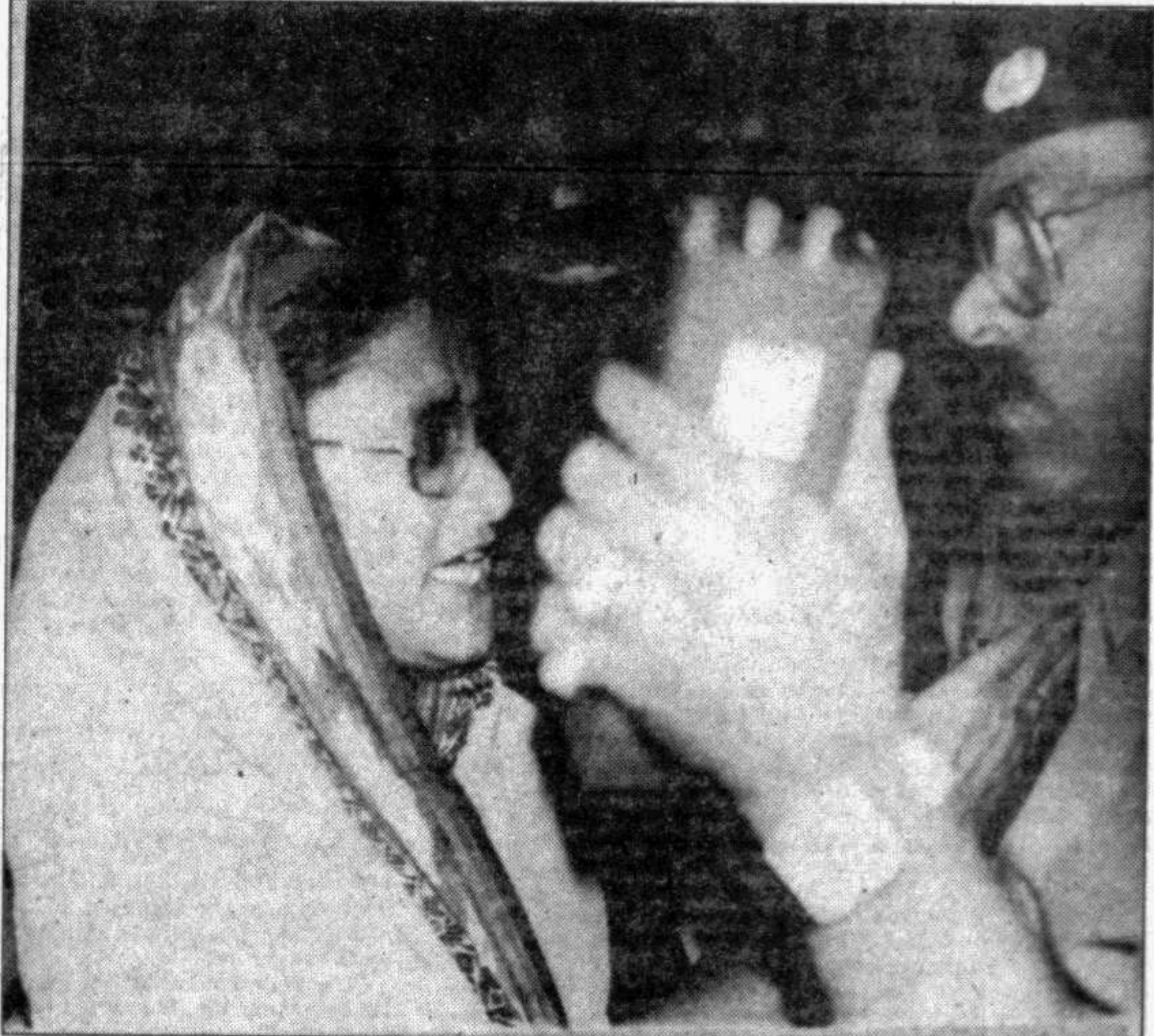
The arrest Nov 11, 1988: Sheikh Hasina being led away to captivity by police officers.