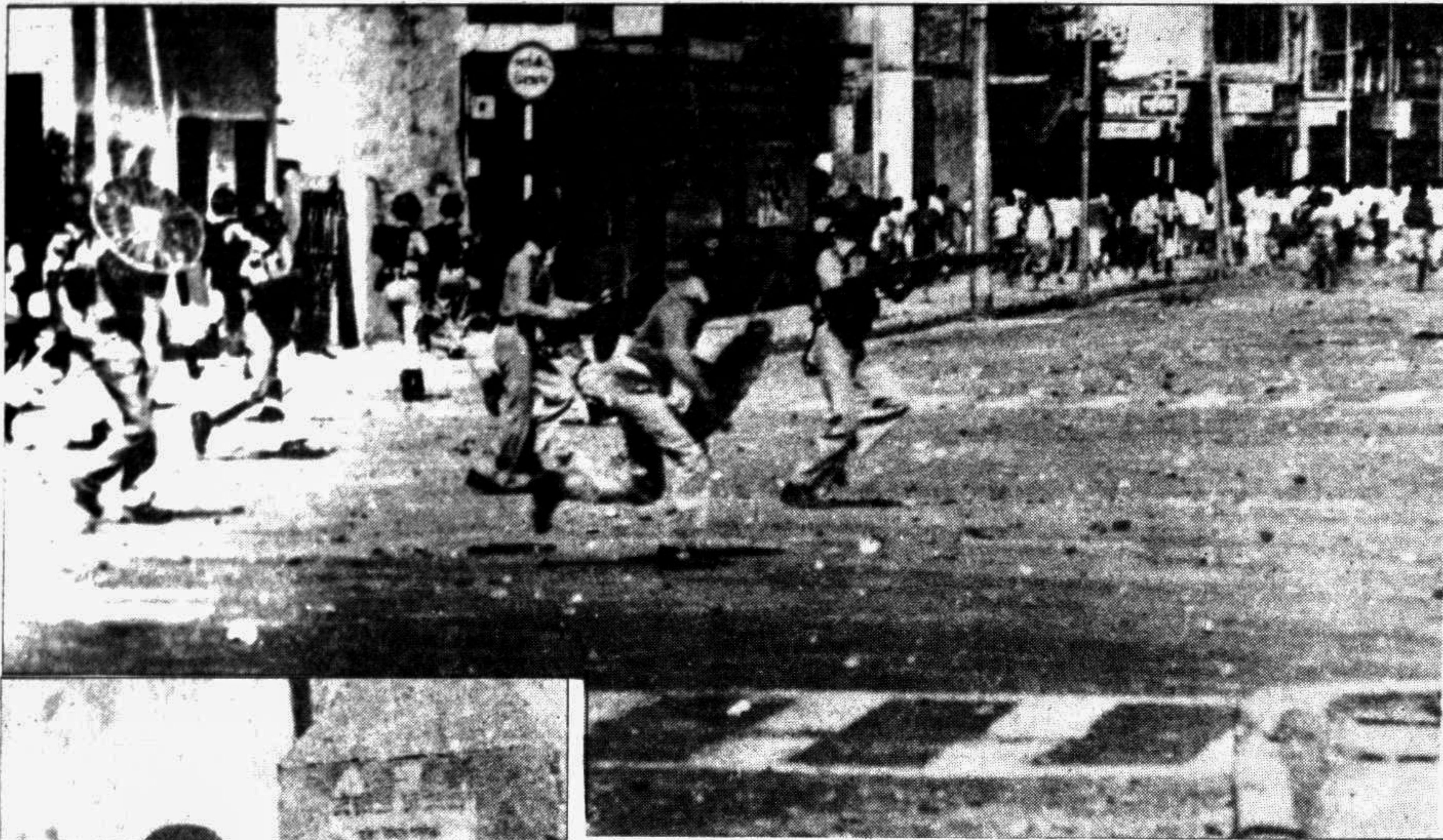
The wild bunch: Police chase demonstrators down Motijheel, shooting into the crowd 1987.