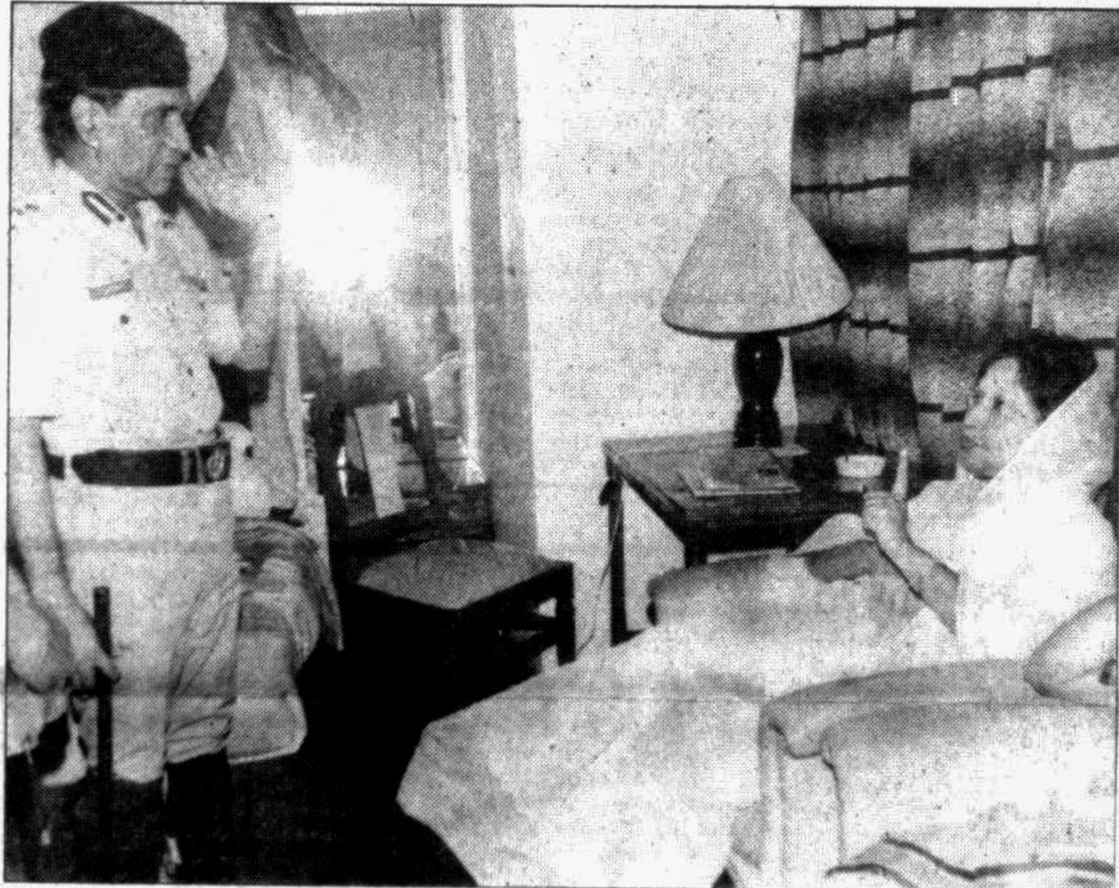
The arrest, Nov 11 1988: The then Police Commissioner of Dhaka, Nasrullah Khan, requesting a defiant Khaleda Zia to come with him.