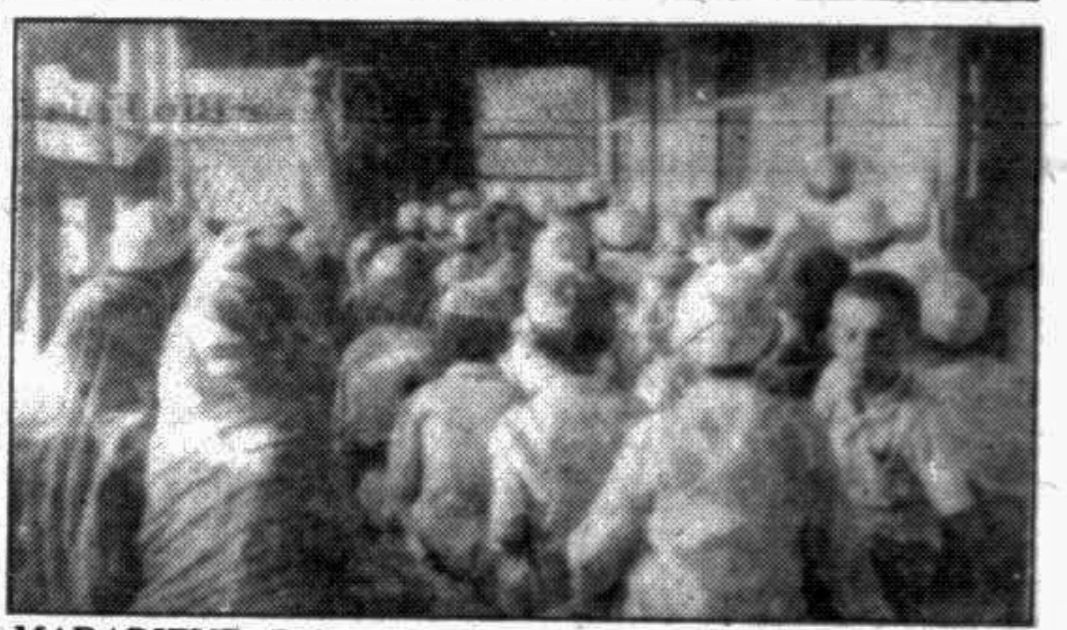
MADARIPUR: Rahim Smriti Sangha has recently opened an institution to learn the Quran.