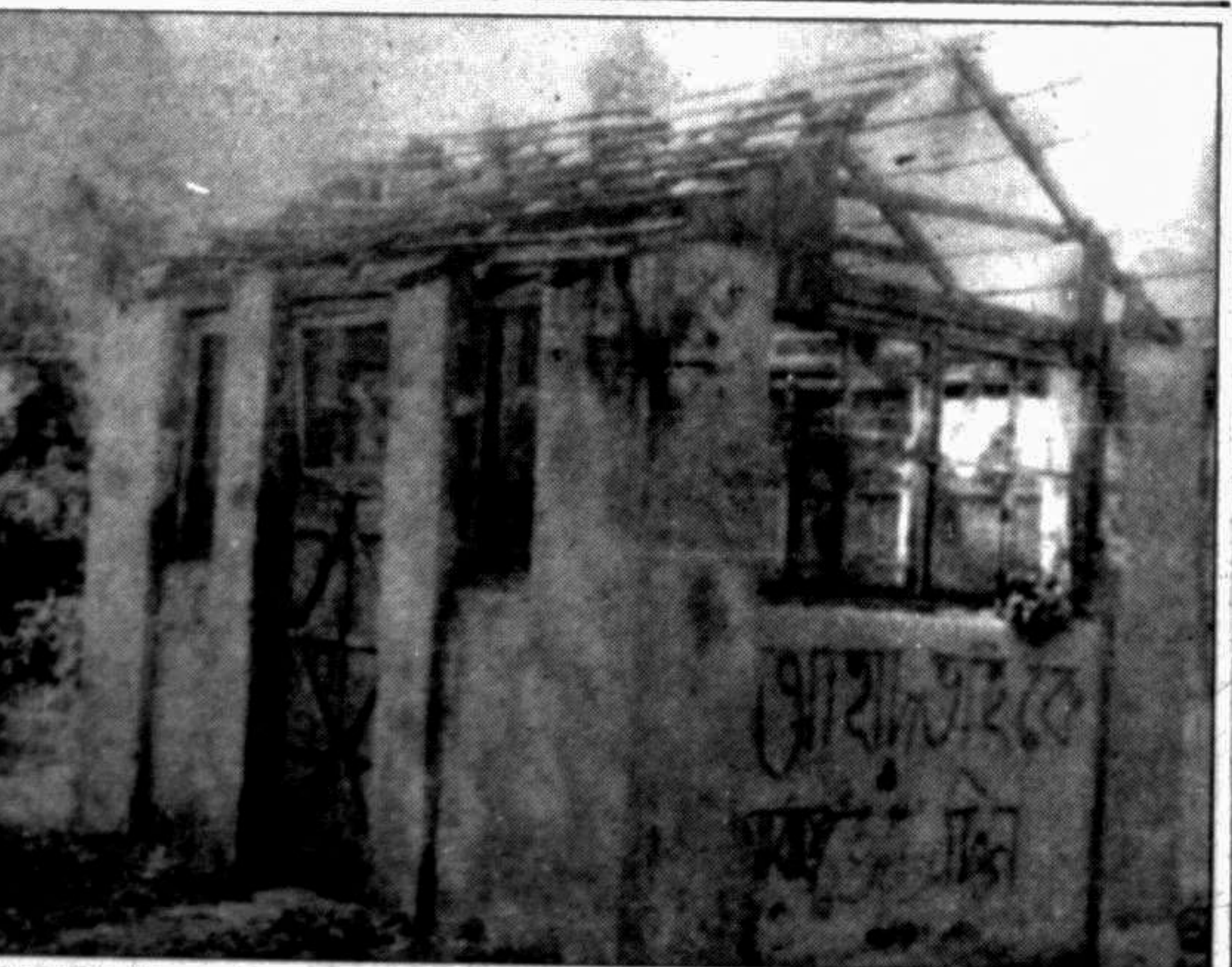
NATORE: The shedless morgue of the sadar hospital. The doctors of the hospital have been facing very much difficulties to conduct autopsy.

The concerned authorities have been urged to ensure requirement to the patients.