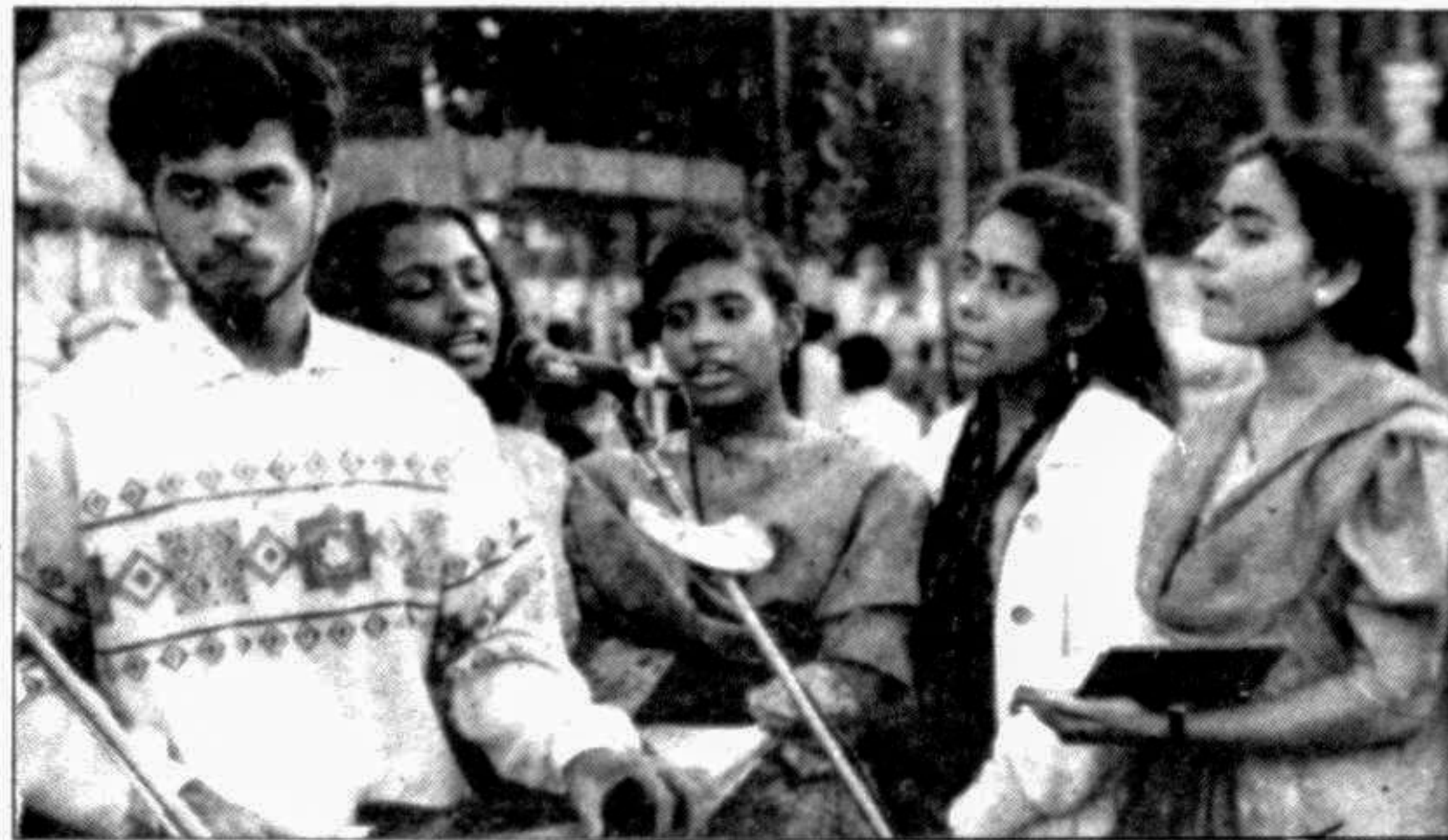
Ganatantrik Chhatra Oikya (GCO) held a cultural programme in remembrance of mass upsurge of '90 in front of the TSC of Dhaka University yesterday.

Later the Minister saw the development work on some educational institutions.