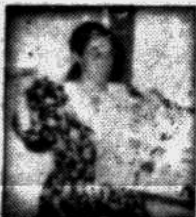
The Magic of Story Telling Page 3