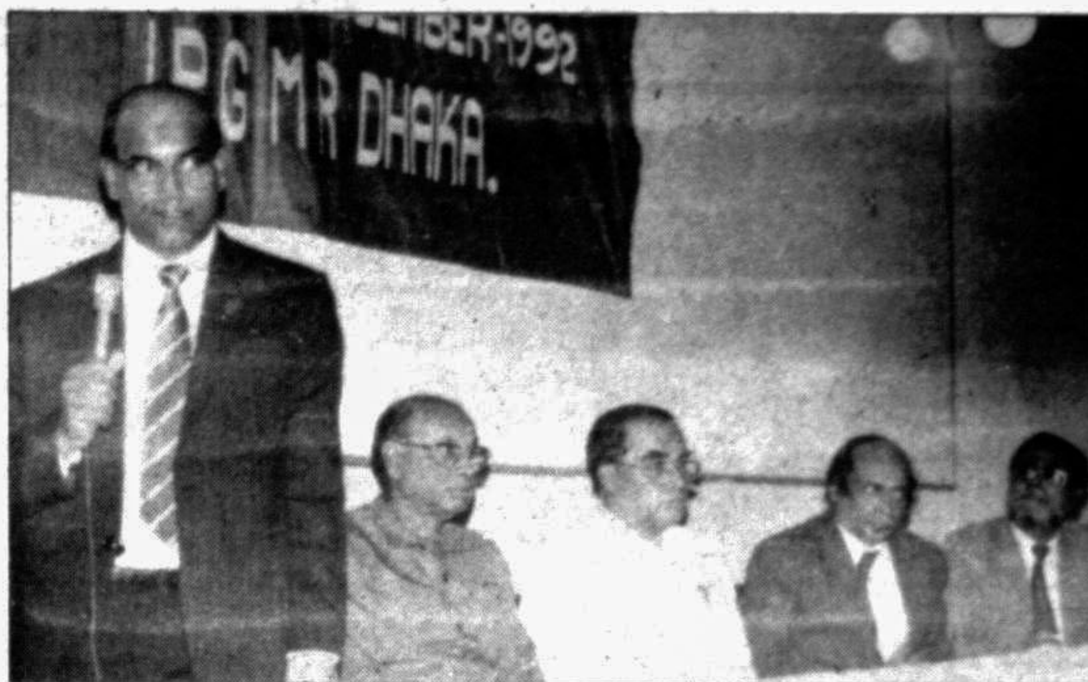
A seminar titled 'Acute Renal Failure: Background and Duty' organised by the Department of Paediatrics was held at Dr Milon auditorium of IPGMR yesterday. — Story on Page 1.

5.00 Opening announcement Al-Quran, Programme summary 5.10 News in Bangla 5.20 Recitation from the Geceta 5.30 School debate 6.30 Open University 7.05 World Disabled Day 7.25 Jiboner Alo 8.00 News in Bangla 8.40 Drama of the week 10.00 News in English 10.30 Dipita Chetana 10.55 China Beach 11.30 Khabar/The News 11.40 Friday's programme summary.