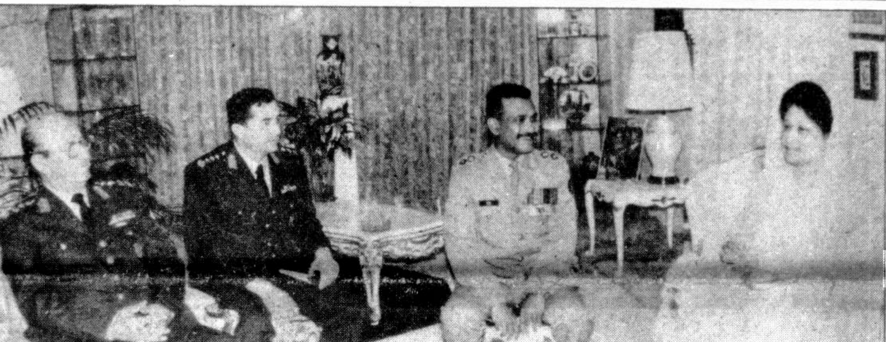
Visiting Turkish Army chief General Muhittin Fisunoglu (extreme left) called on Prime Minister Begum Khaleda Zia at her residence yesterday.