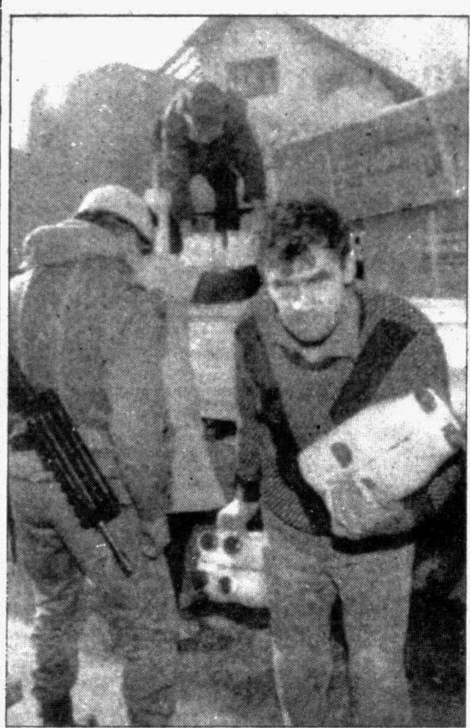
An old man from the hospice of Nedzanicia, Sarajevo, takes food from a truck unloaded by French-UN troops yesterday.

From Mahfuz Anam JEDDAH, Dec 1: King Fahd of Saudi Arabia today appealed to the United Nations to lift UN arms embargo on Bosnia to fight the Serbian army. Inaugurating the sixth conference of the 47-member Organisation of Islamic Countries (OIC) here, the Saudi monarch also called for a world-wide outrage against what he termed oppression and continuous transgression of the rights of the people of Bosnia-Herzegovina. 'Bosnian people must be allowed to receive arms to protect themselves', he said in emotion-filled voice. King Fahd, however, expressed his deep appreciation of the United Nations response to situation, especially its delivery of humanitarian assistance. The Saudi monarch's call is widely interpreted as a move by the Islamic countries for partial lifting of ban on arms supply to the besieged Bosnia-Herzegovina. The two-day meeting is expected to issue a strongly worded call on the UN to use force to end what the OIC states term Serb aggression against Bosnian Muslims. This is the second emergency meeting of OIC, on Bosnia-Herzegovina issue following the first one that was held last June in Istanbul. The OIC was established in 1969 after the worldwide protest against the fire that partially burnt down the Al Aqsa Mosque. See Page 12 Col 1