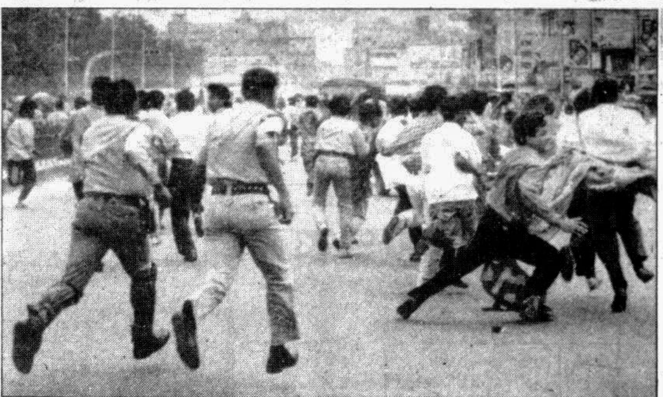
Police chasing JP activists near Gulistan Square yesterday.