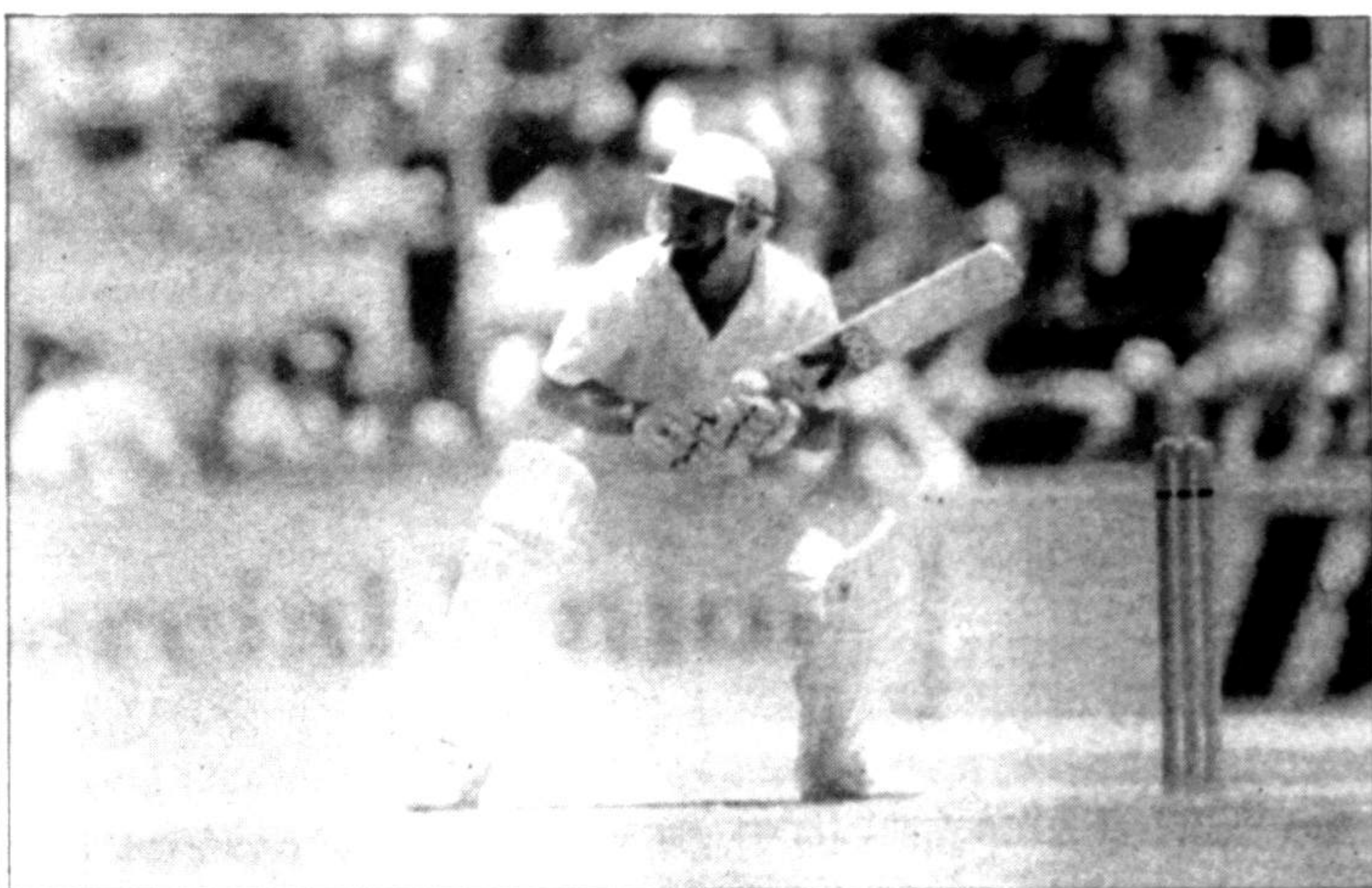
Skipper Kepler Wessels ducks a delivery during South Africa's second innings of the second Test at Johannesburg on Sunday. Wessels made 11 before being run out. The Test ended in a draw yesterday.

Pony Electronics outplayed Tilak Chess Club 4-0 to take their collection to 23 points while Dhaka University, who have also 23 points, beat Genius Chess Club 3-1 yesterday.