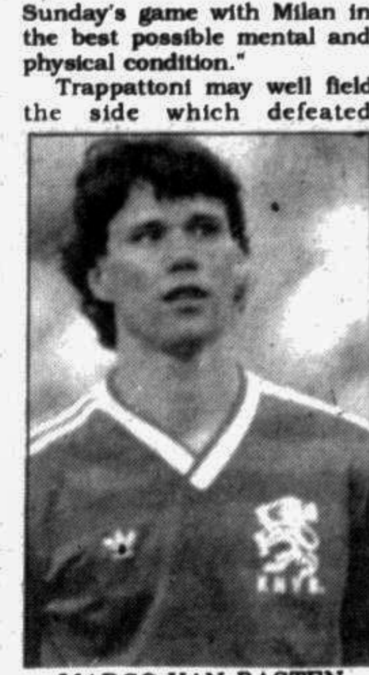
MARCO VAN BASTEN

ROME, Nov 27: Four goals from Marco van Basten in AC Milan's European Cup win over IFK Gothenburg this week will strike fear into the hearts of Juventus fans before the top-of-the-table clash on Sunday, reports Reuter.