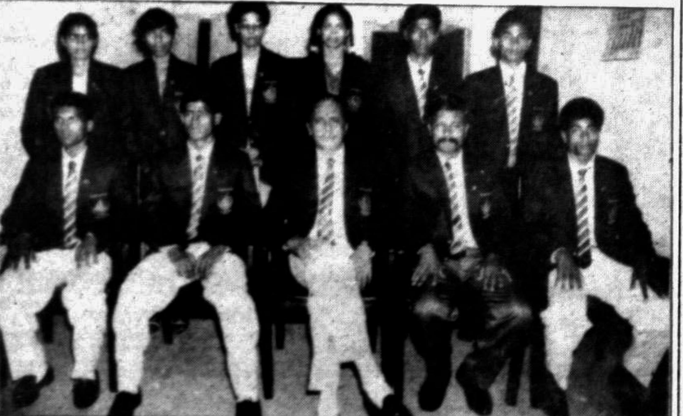
An eleven-member Bangladesh athletics team left Dhaka yesterday for Delhi to take part in the fourth Asian junior championships to be held in the Indian capital from November 30 to December 4.

Watts and Kevin Young who are also backing moves for change, warned: "A boycott of Stuttgart is still an option."